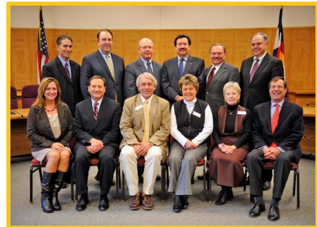
Colorado Transportation Commission