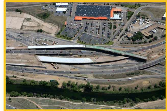
I-25 over Santa Fe (US85)