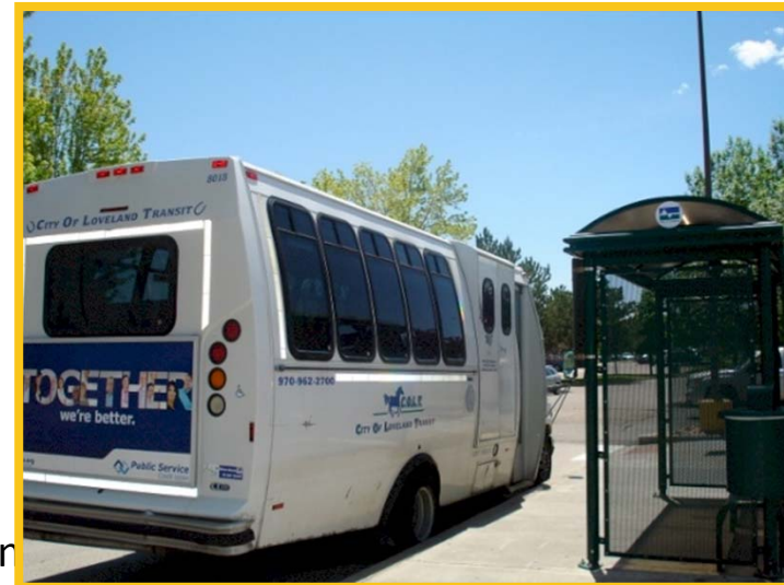
Loveland's COLT service