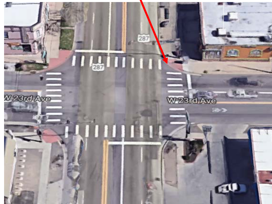
Ramp Location: Federal Blvd and W 23rd Ave

https://www.denvergov.org/maps/map/property