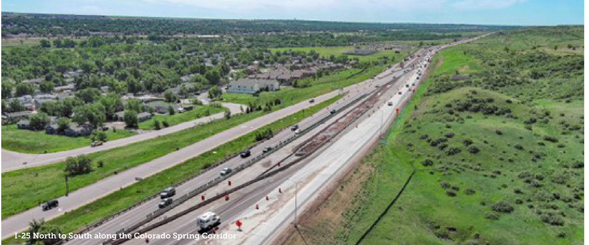
I-25 North to South along the Colorado Spring Corridor

I-25 is the backbone of Colorado's vehicular mobility and freight movement and is the major north to south transportation corridor in Colorado Springs.