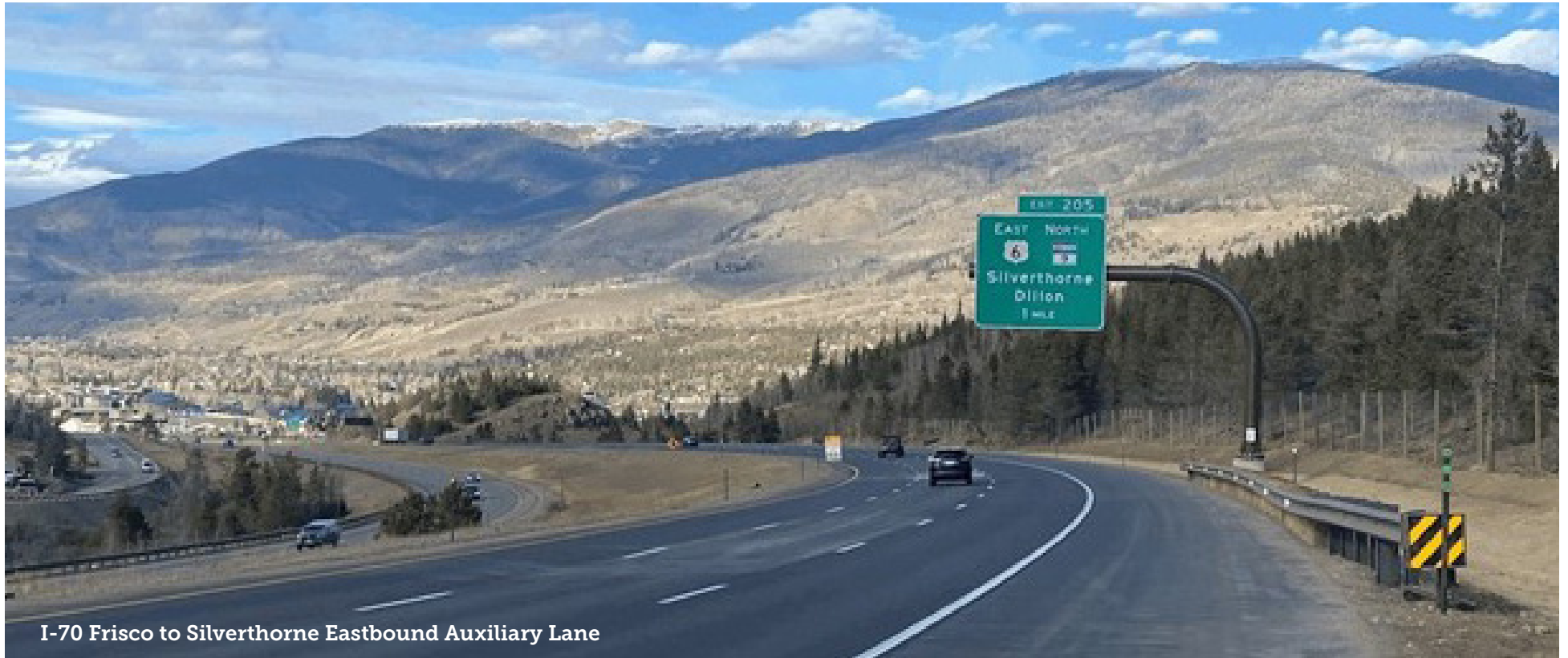
I-70 Frisco to Silverthorne Eastbound Auxiliary Lane