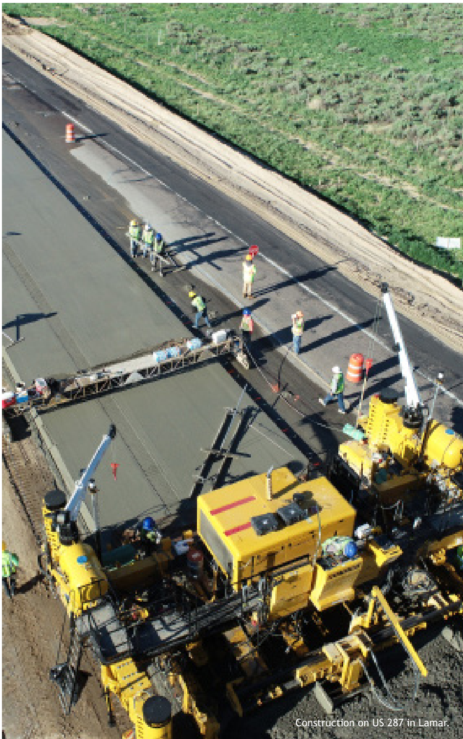
Construction on US 287 in Lamar.

Updated 10-Year Strategic Project Pipeline - November 2023