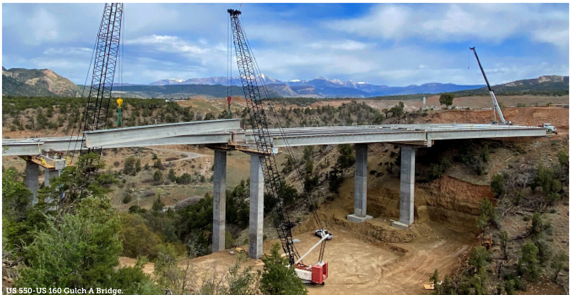
US 550-US 160 Gulch A Bridge.