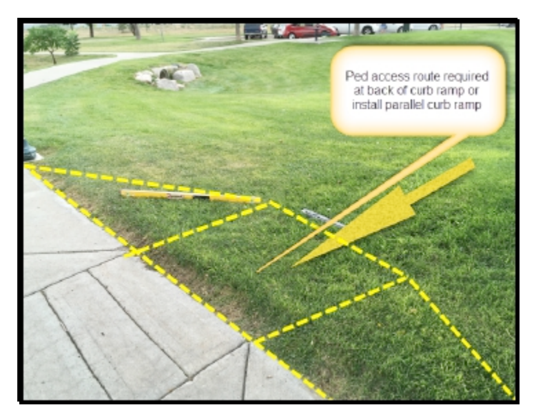
#9 - landing area needed