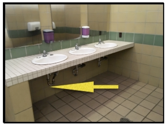
#6 - Wrap left drain pipe men's room