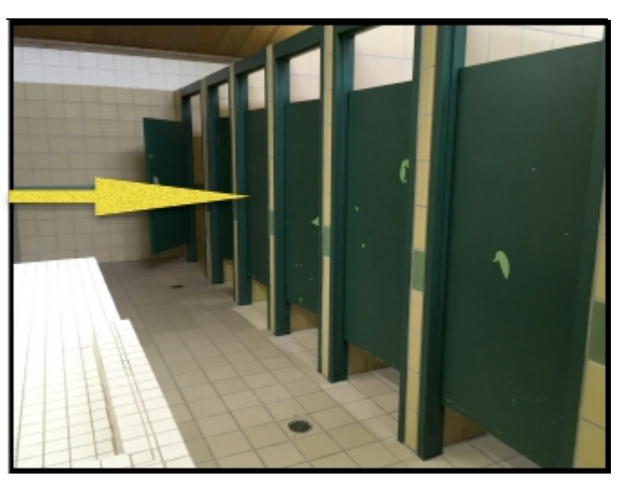
#8 - Create ambulatory stall