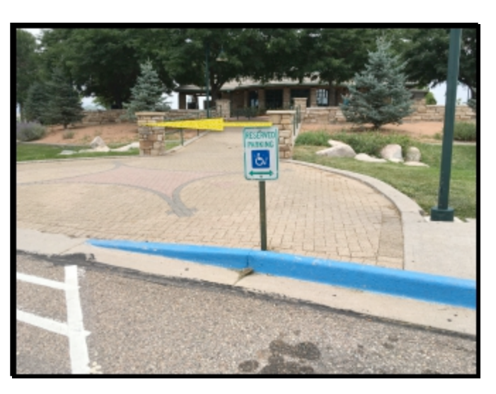
#2 - Install ISA symbol sign on stone pedestal with arrow to left