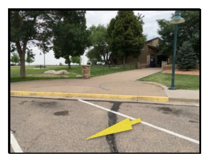
#3 & #4 - 2 new accessible spaces and curb cut