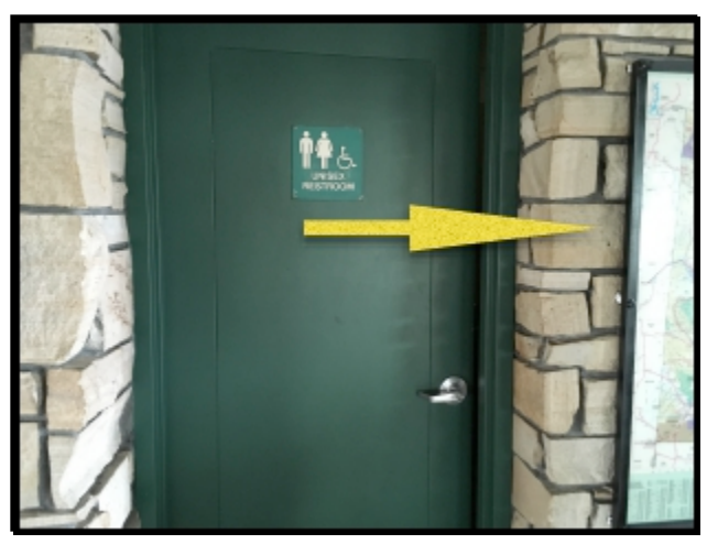
#7 - Add sign on latch side of door