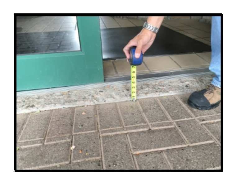
#5 - Grind threshold lip/ edge <1/2"