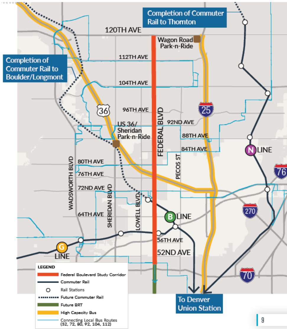
Federal Boulevard Multimodal Transportation Study BRT Project Limits