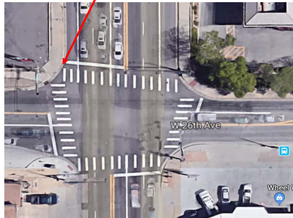
Ramp Location: Federal Blvd and W 26th Ave

https://www.denvergov.org/maps/map/property