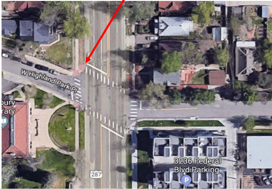
Ramp Location: Federal Blvd and W Highland Park