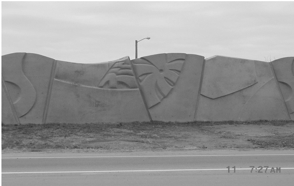
Illustration 18-3 Artistically Treated Precast Concrete Noise Barrier: SH-47 in Pueblo

The character of a rural environment is one of open spaces, native trees, shrubs, grasses, and earth and sky which promote a random, natural appeal. Noise barriers in these areas should be constructed so that they will appear to be associated with the rural atmosphere. The adjacent area should be planted with native plant materials in random groupings. By contrast, the urban environment is one of geometric lines, orderly development, human activity, confined spaces, structures, and pavement. Random, natural groupings of plant materials can be used to complement noise barriers in urban areas where a community desires to make a statement about its image, connection, and support of the natural environment.