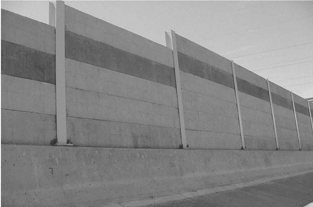
Illustration 18-2 Post-and-Panel Noise Barrier Mounted on Type 7 Barrier: US-6 in Lakewood