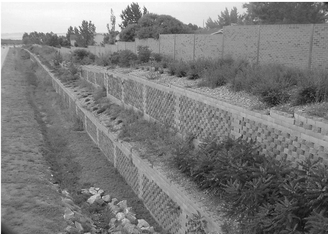
Illustration 18-5 Terraced Landscaping With Noise Barrier: US-287 Lafayette Bypass