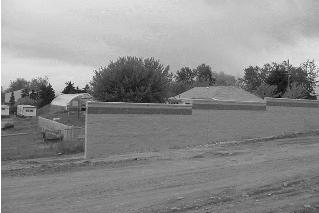
Illustration 18-1 Cast-in-Place Masonry I-76 East of York Street

A noise reduction benefit of 5 dBA is fairly simple to achieve, but a 7 dBA reduction is required at a minimum of one receptor along the wall. Reductions of 15 or more dBA are difficult to almost impossible to achieve, since to do this requires a reduction of at least 97 percent of the initial acoustic energy of the source.