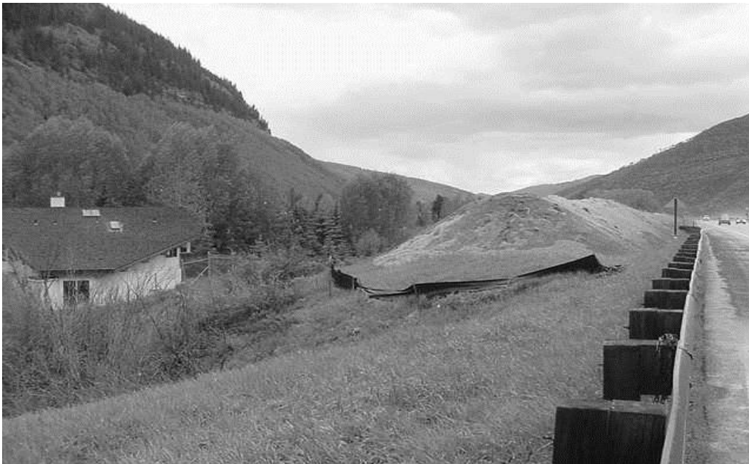
Illustration 18-6 Recycled Sand Berm: I-70 East of Vail

For safety and erosion control purposes, the slopes of an earth berm should be 2:1 or flatter, although a 3:1 slope is preferable. The ends of the berm should have a lead-in slope of 10:1 and curve toward the highway. Berms can be either vegetated or seeded, and slope stabilization should be done as soon as possible after construction.