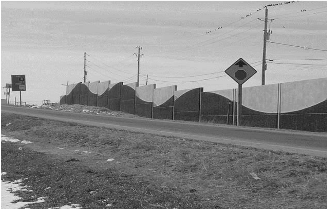
Illustration 18-7 Combination Barrier: I-25 @ Exit 188

For areas where a full berm cannot be constructed, such as a situation where there is limited right of way, a combination barrier can be constructed. This involves building up the earth berm to a desired height and constructing a wall on the berm. The soil in the berm must be stable enough to support a wall structure foundation.