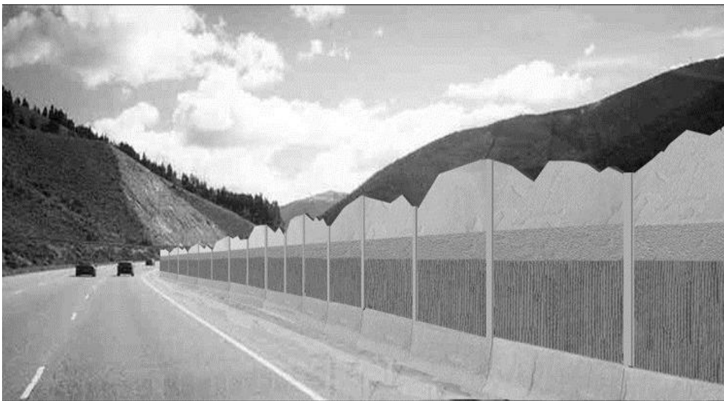
Illustration 18-4 I-70 Dillon Valley Noise Barrier