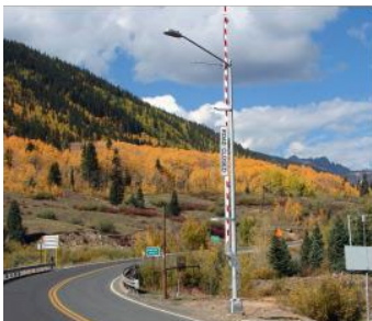
Region 5 US 550 Silverton

Sometimes tenants lease real property and build or add improvements to the leased property for their use. Tenants often have the right or obligation to remove the improvements at the expiration of the lease term. If, according to the appraisal, the improvements are considered to be real property, the Agency must make an offer to the tenants to acquire these improvements.