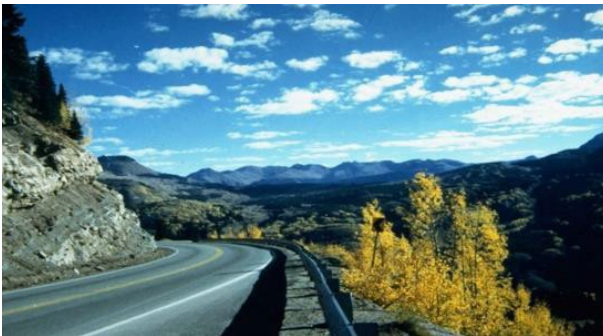
Region 5 Colorado's Famous "Million Dollar Highway" Part of the San Juan Scenic Skyway US 550

If improvements are considered personal property under state law, the tenant-owner may be reimbursed for moving them under the relocation assistance provisions. The real estate specialist will personally contact the tenant-owners of improvements to explain the procedures to be followed. Any payments must be in accordance with federal rules and any applicable state laws.