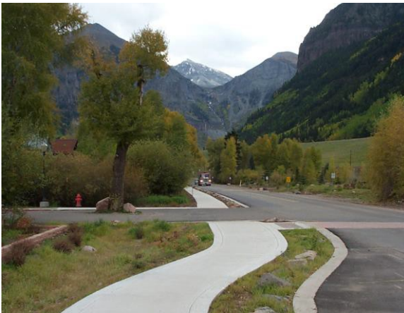
Region 5 Telluride Sidewalks Transportation Enhancement for a Local Agency

“The purpose of this title is to establish a uniform policy for fair and equitable treatment of persons displaced as a result of federal and federally assisted programs in order that such persons shall not suffer disproportionate injuries as a result of programs designed for the benefit of the public as a whole.”