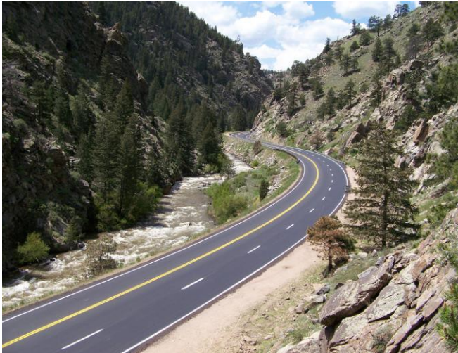
Region 1 U.S. Hwy. 6 Clear Creek Canyon: rock fall mitigation

Please do not sign a sales contract or lease agreement for a new home until your relocation agent has inspected it and assured that it meets DSS standards.