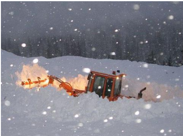
Region 5 U.S. Hwy. 160 west of Wolf Creek Pass

Chief Engineer CDOT 4201 East Arkansas Avenue Denver, Colorado 80222