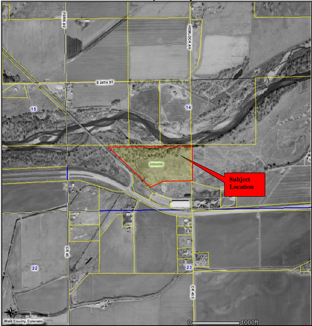
Approximation of the subject property is high-lighted in red