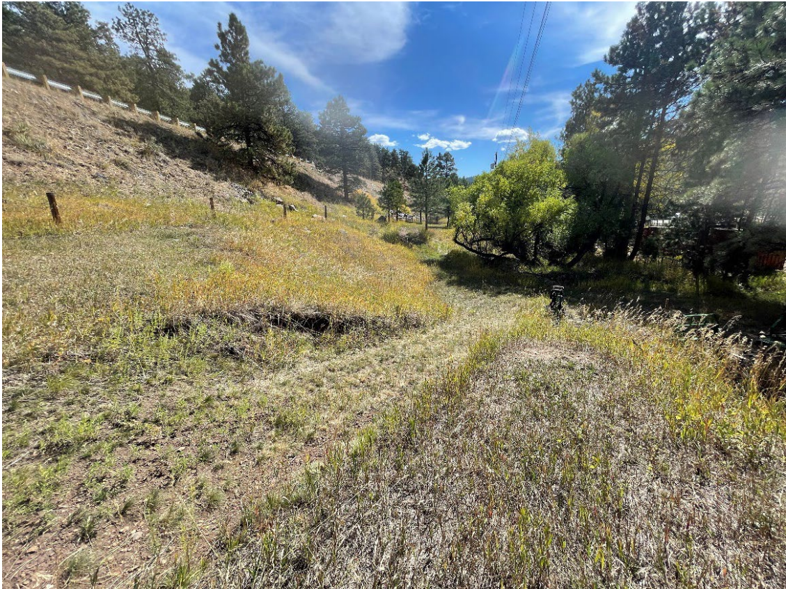
View from center of subject looking Southeast.