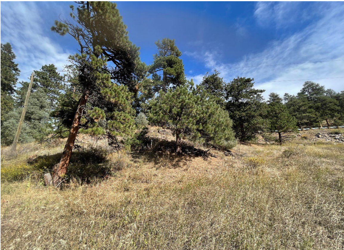
View from Northwest of the subject looking East to US 40.