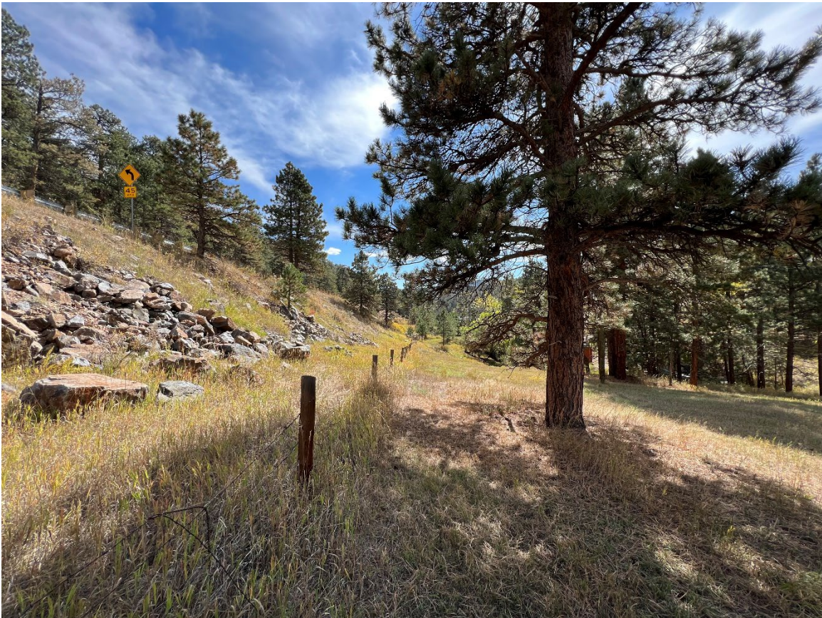
View from East of subject looking South.