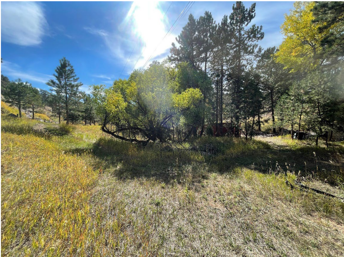
View from center of subject looking South.