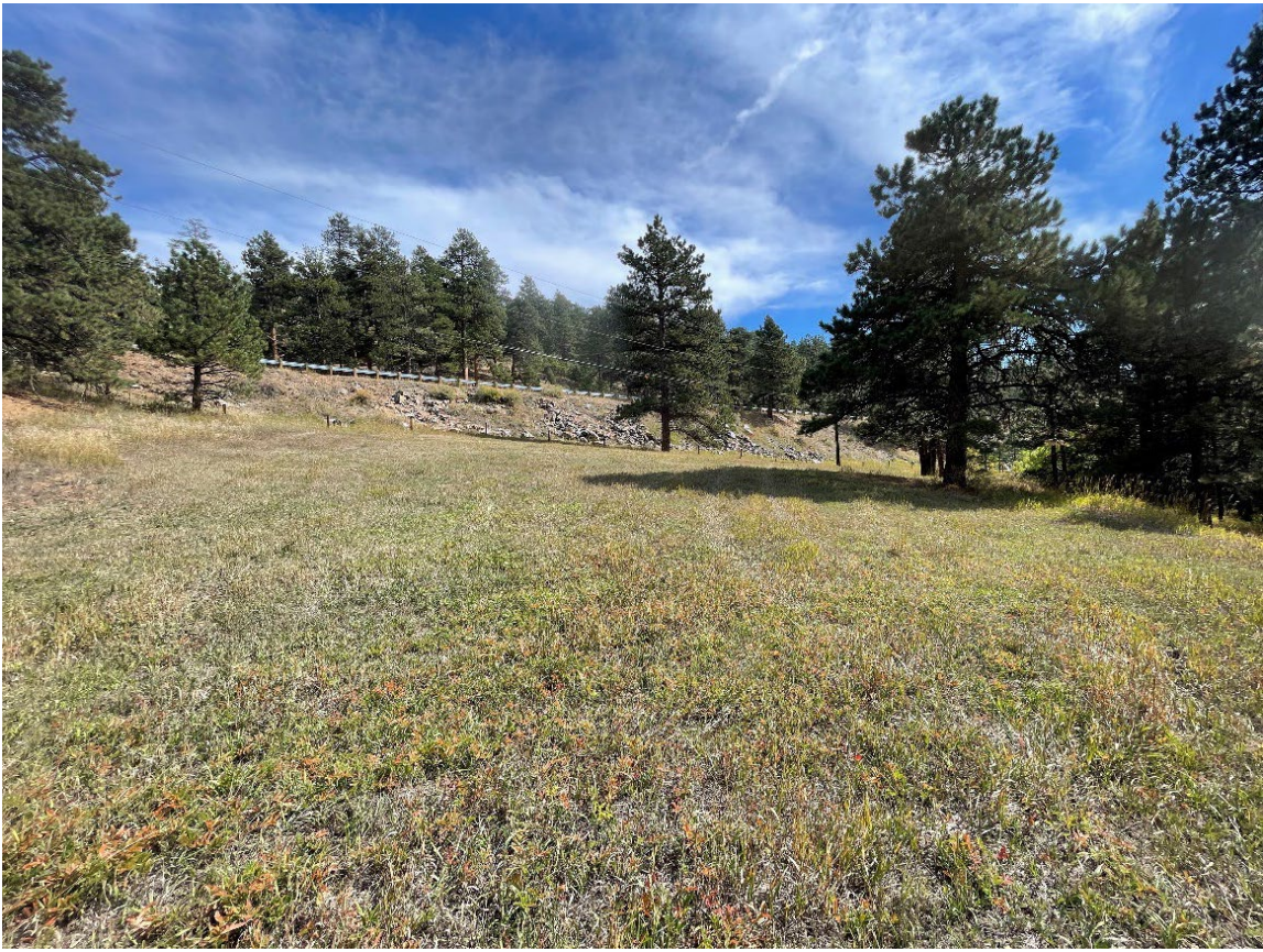
View from Northwest of the subject looking Southeast toward US 40.