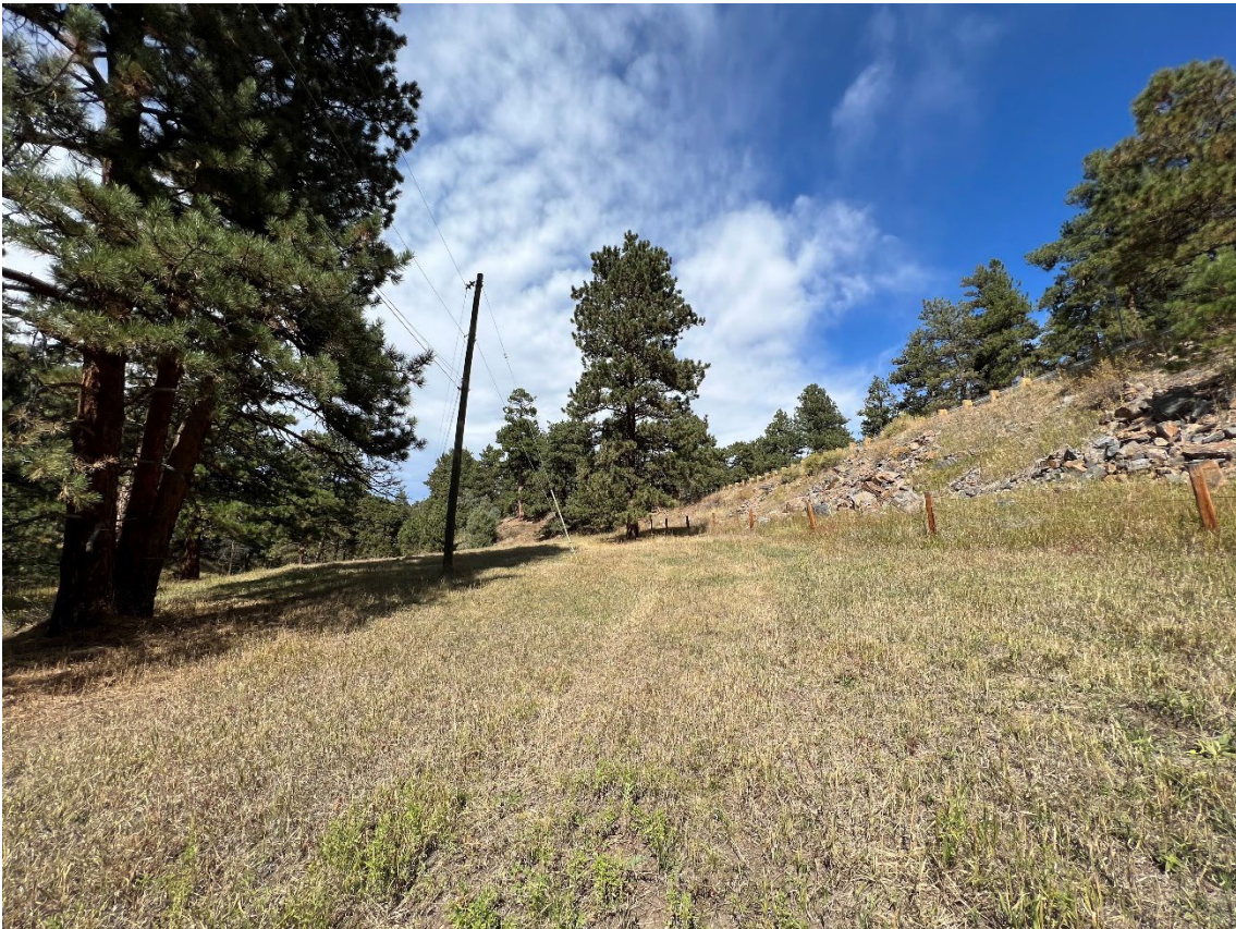
View from South of subject looking North.