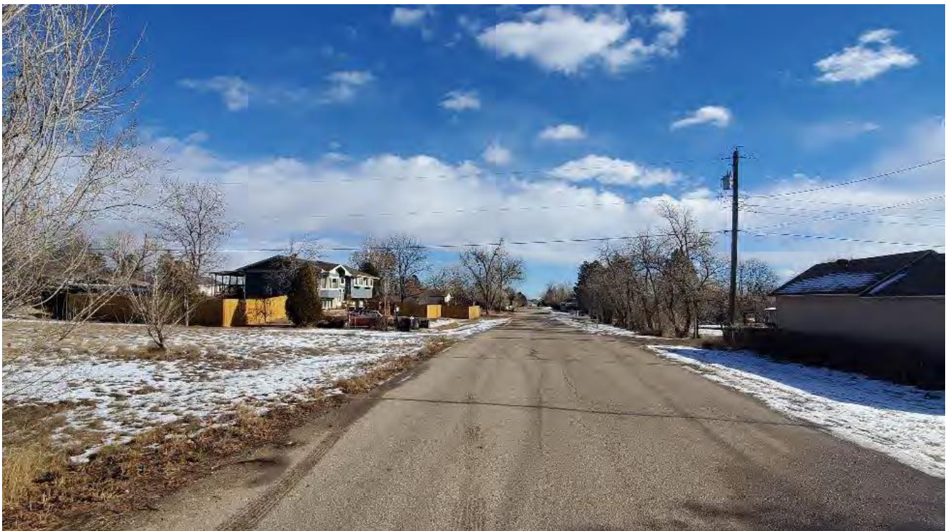
Easterly View of Southern Border Along W. 11 th St