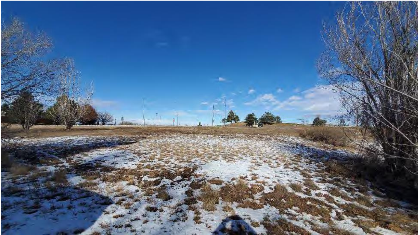
Northerly view from W 11 th St Along Southern Border