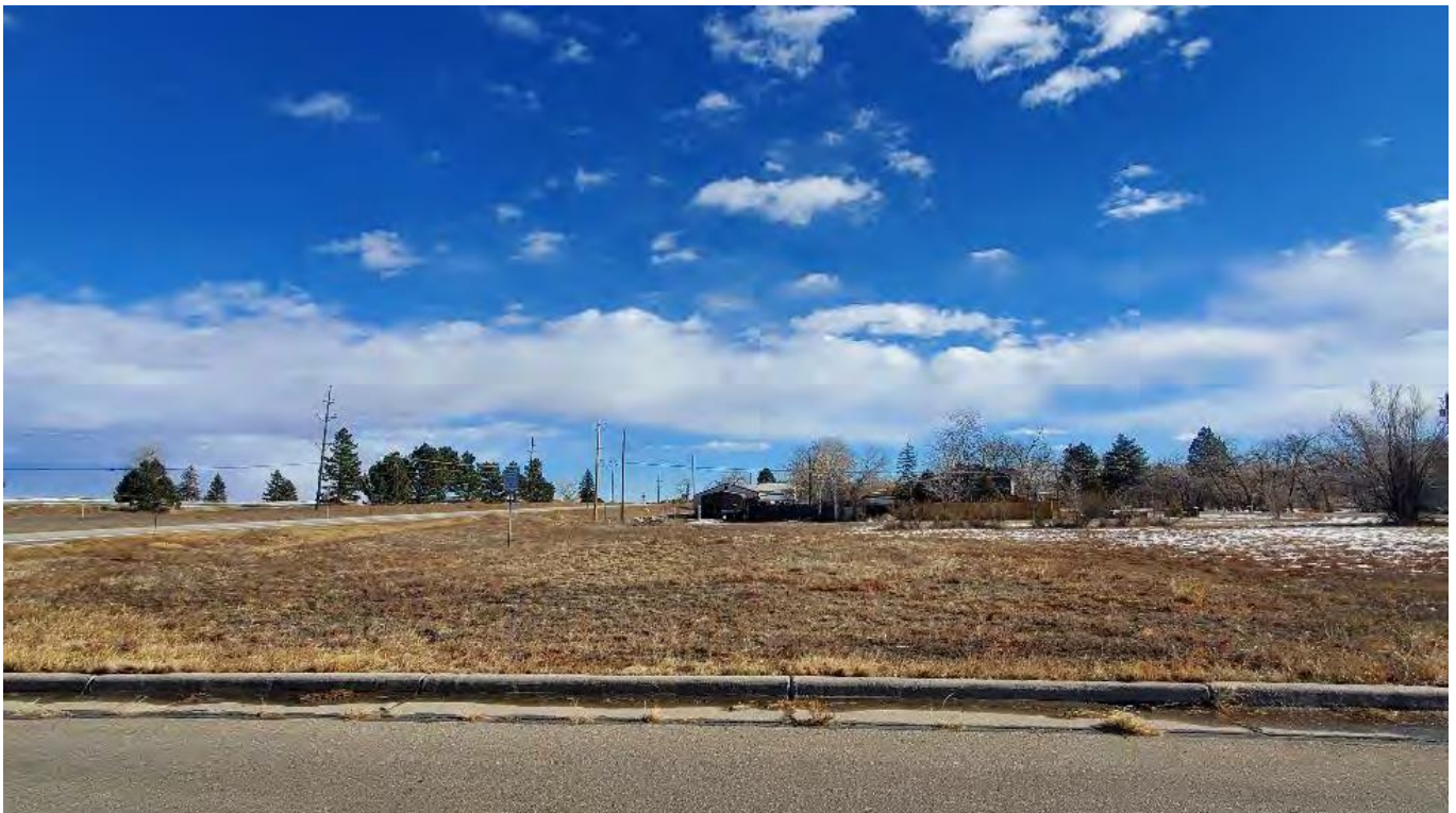
Easterly View from 77 th Ave