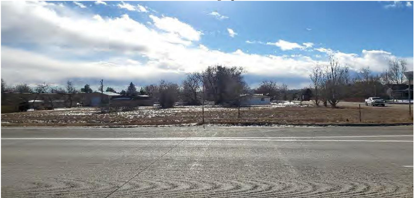
Southerly View from 10 th St.