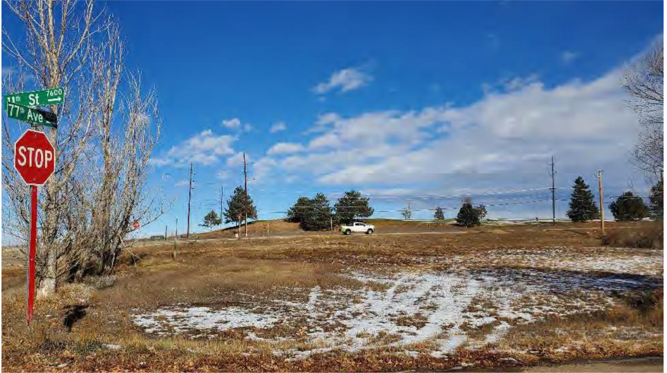
Northerly View from the Southwest Corner