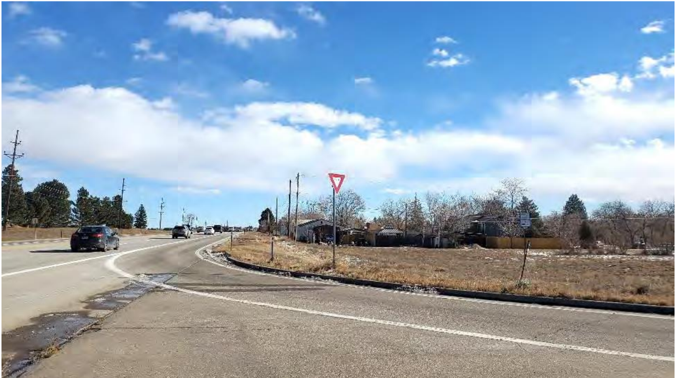
An Easterly View of Northern portion of the Parcel