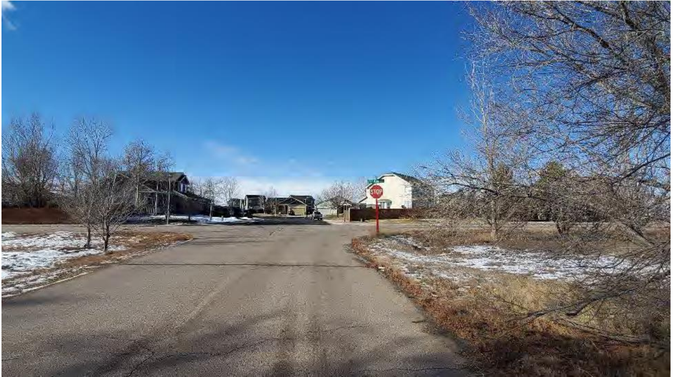
Westerly View of Southern Border along 11 th St. Toward 77 th Ave