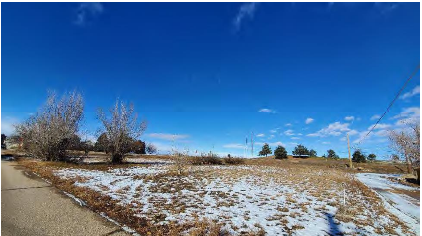
Northwesterly View from the Southeastern Corner