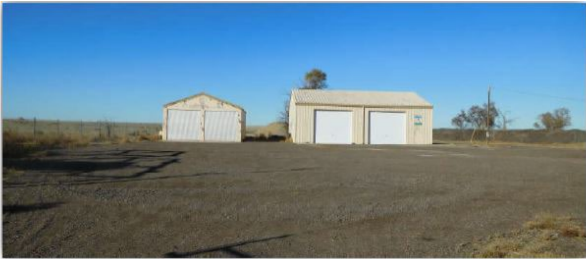
North view of buildings from property entrance