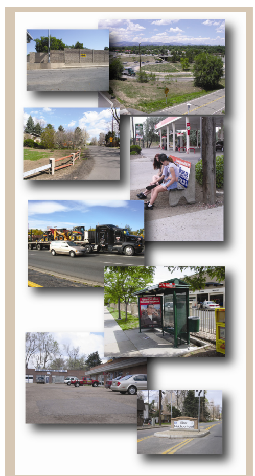
The proposed US 6/Wadsworth project would have mostly beneficial effects to social and natural resources in the study area.