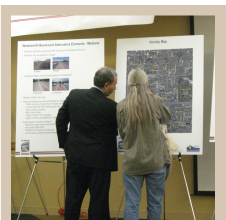
Hundreds of people attended open houses and other briefings to learn about the US 6/Wadsworth study and provide input.