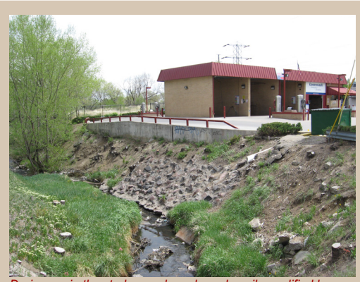
Drainages in the study area have been heavily modified by past development. While the US 6/Wadsworth project would destroy several small wetlands, proposed widening of gulches would improve conditions for new wetlands and natural riparian areas to establish.