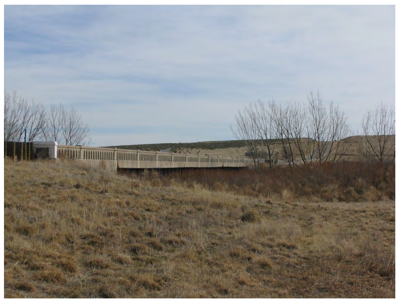
Beaver Creek Bridge, Washington County, US Highway 36, Riveted Girder Continuous