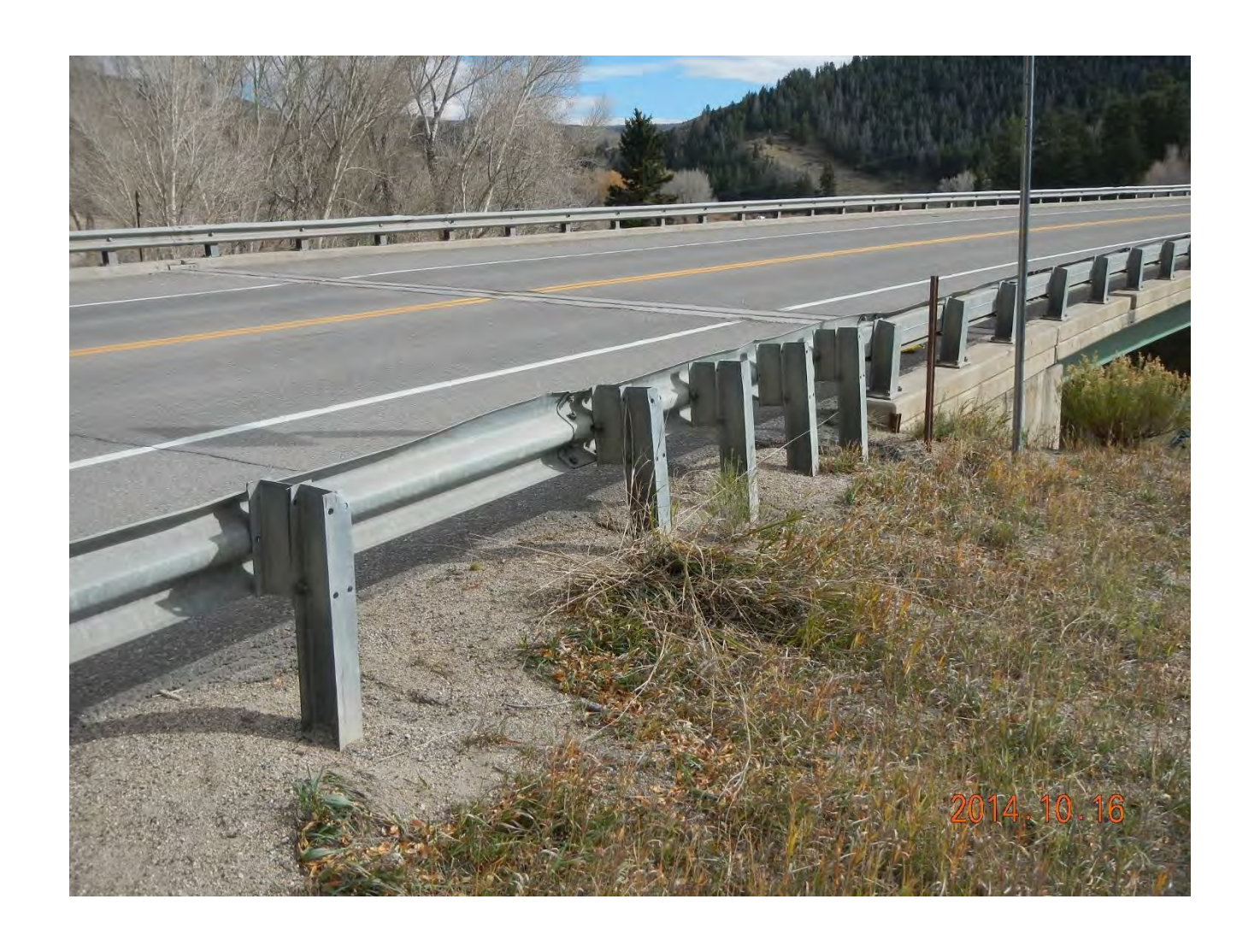
Byers Canyon Bridge, Grand County, US Highway 40 Steel Box Girder Continuous