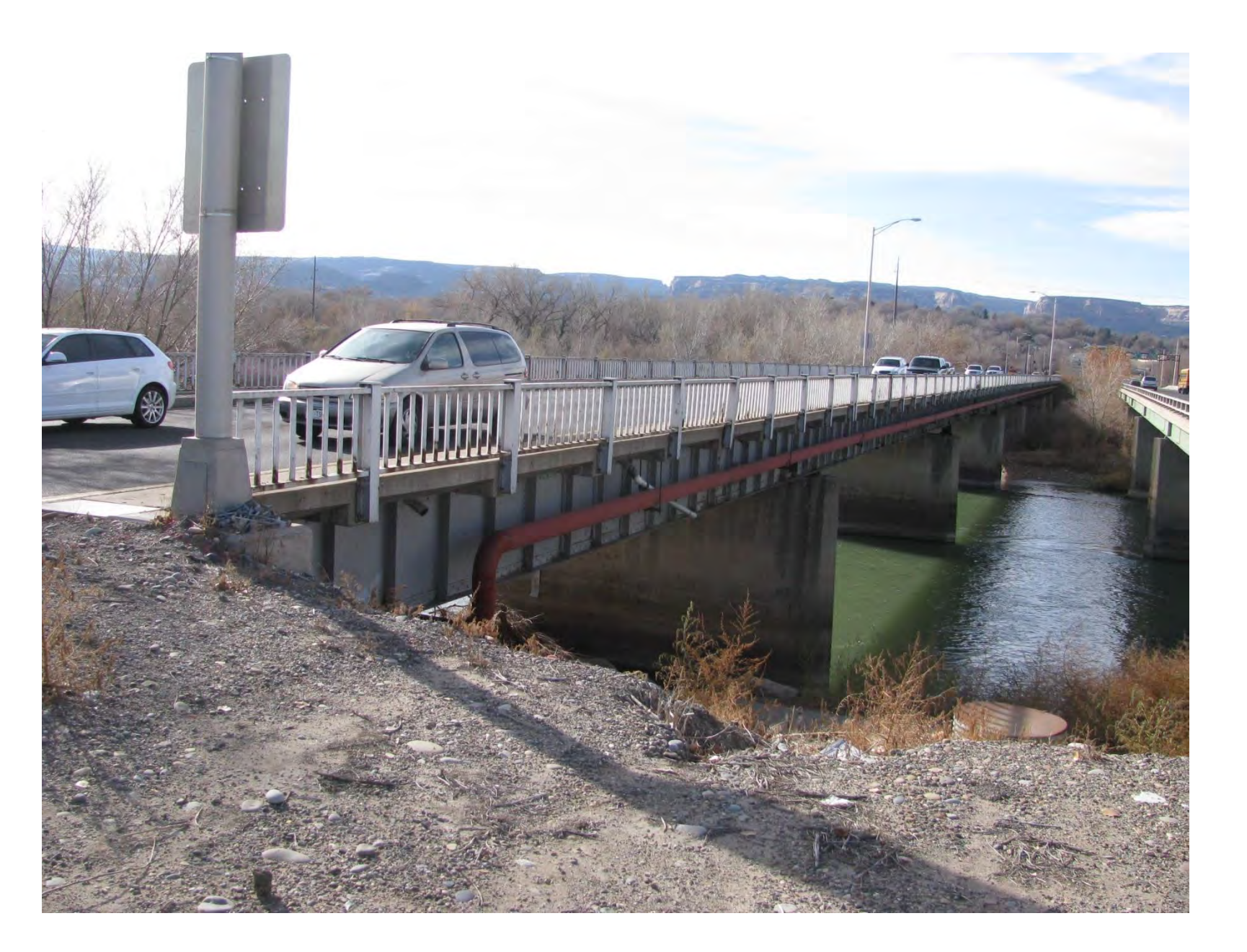
Grand Avenue Bridge, Mesa County, State Highway 340, Riveted Girder Continuous