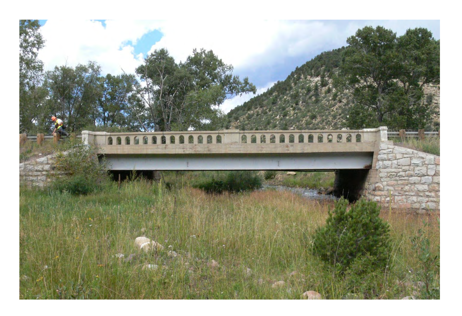
Purgatoire River Bridge, Las Animas County, State Highway 12, Concrete on I-Beam