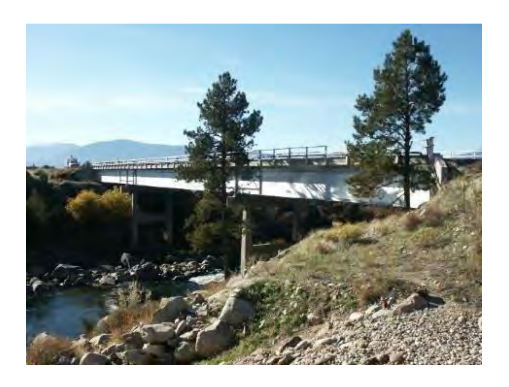
Arkansas River Bridge, Chaffee County, State Highway 291, Welded Girder Continuous and Composite