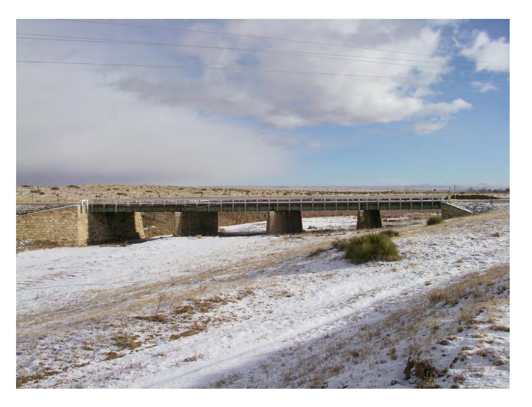
Missouri Creek Bridge, Huerfano County, State Highway 69, Steel Stringer Timber Floor