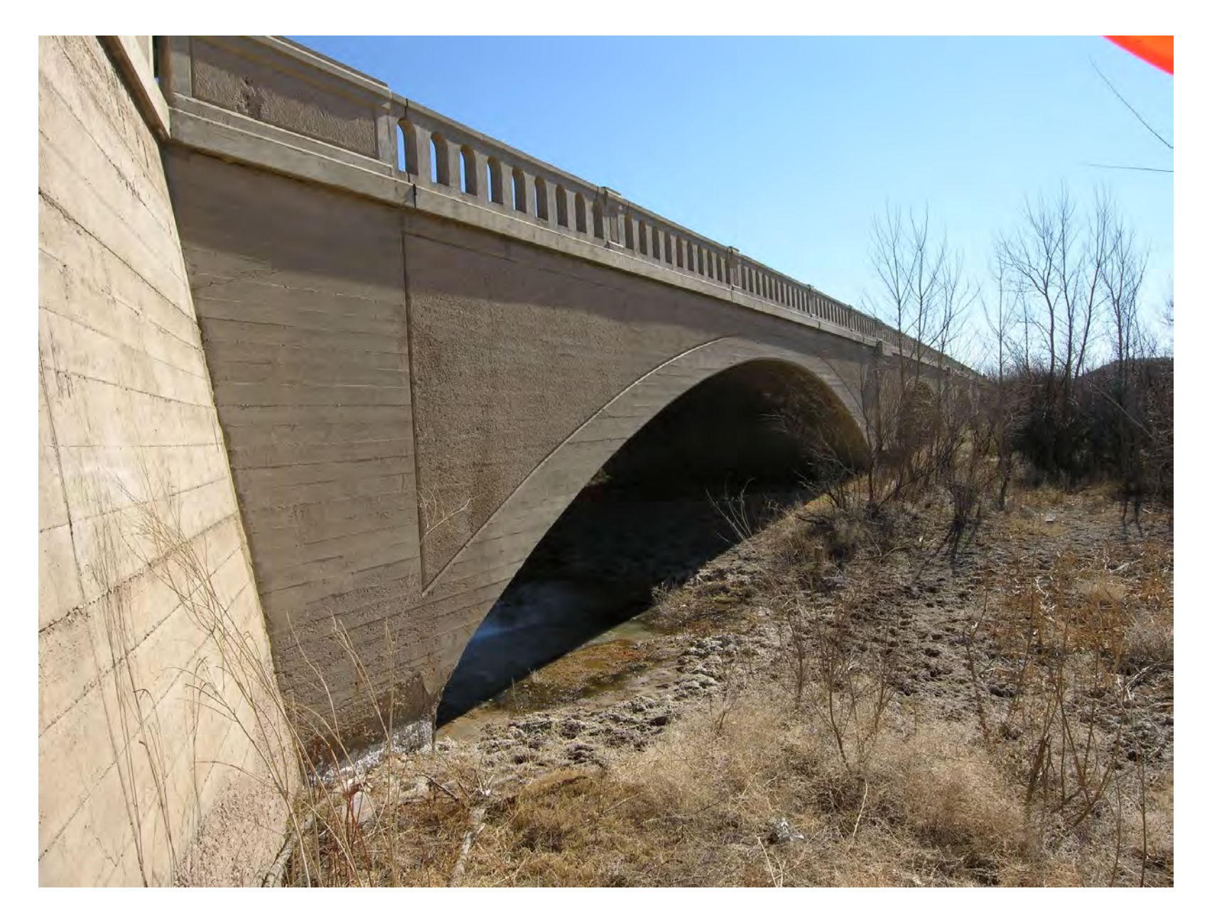
Huerfano Bridge, Pueblo County, US HIghway 50, Concrete Filled Spandrel Arch