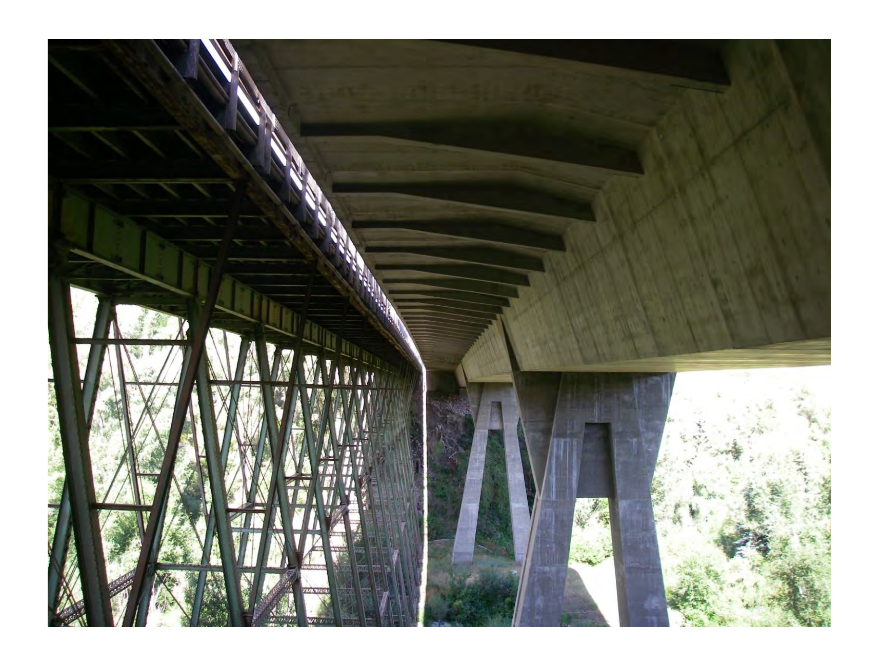
Maroon Creek Bridge, Pitkin County, Bike/Pedestrian Bridge, Riveted Girder (old bridge to the left)