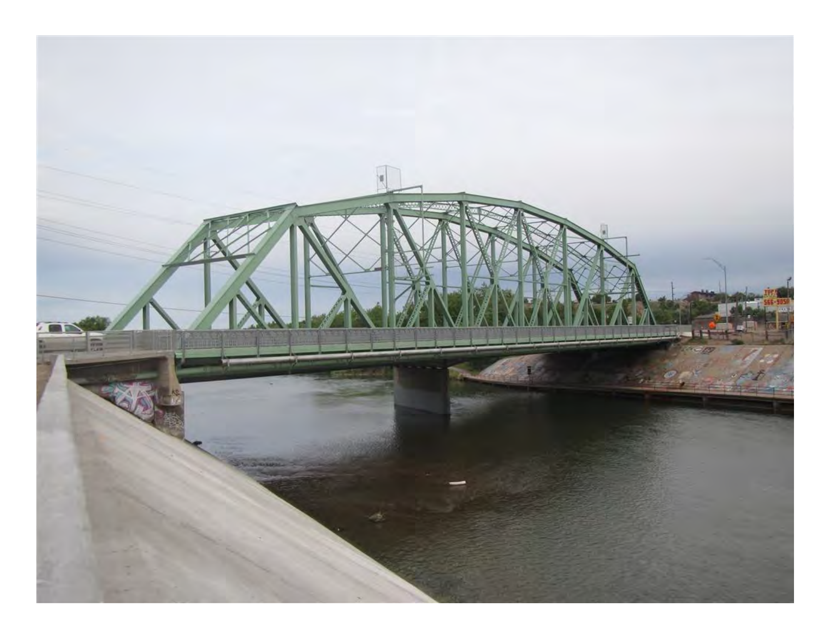
Santa Fe Avenue Bridge, Pueblo County, US Highway 50 Business, Steel Pennsylvania through truss