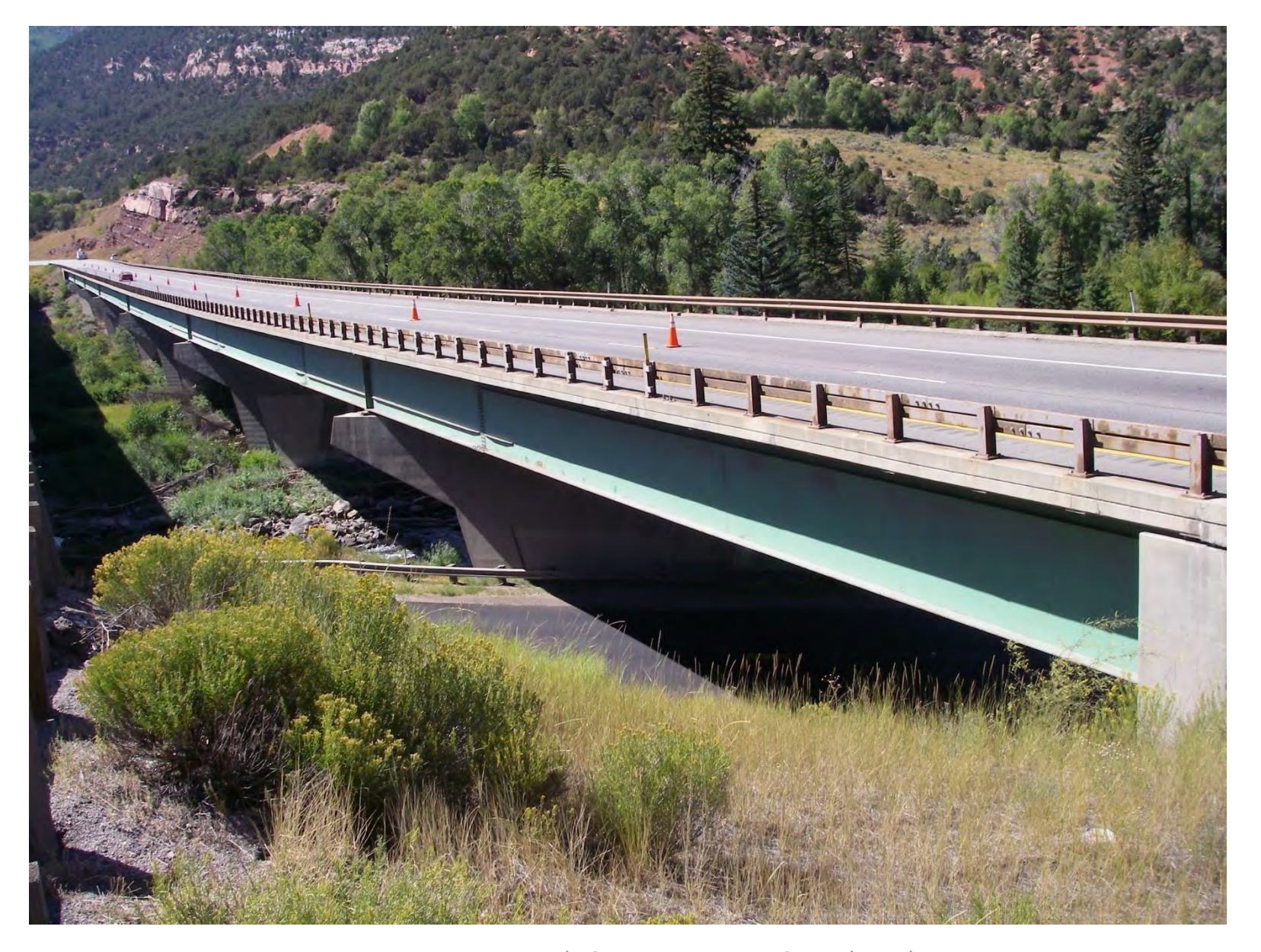
No Name, Eagle County, Interstate 70 Westbound,