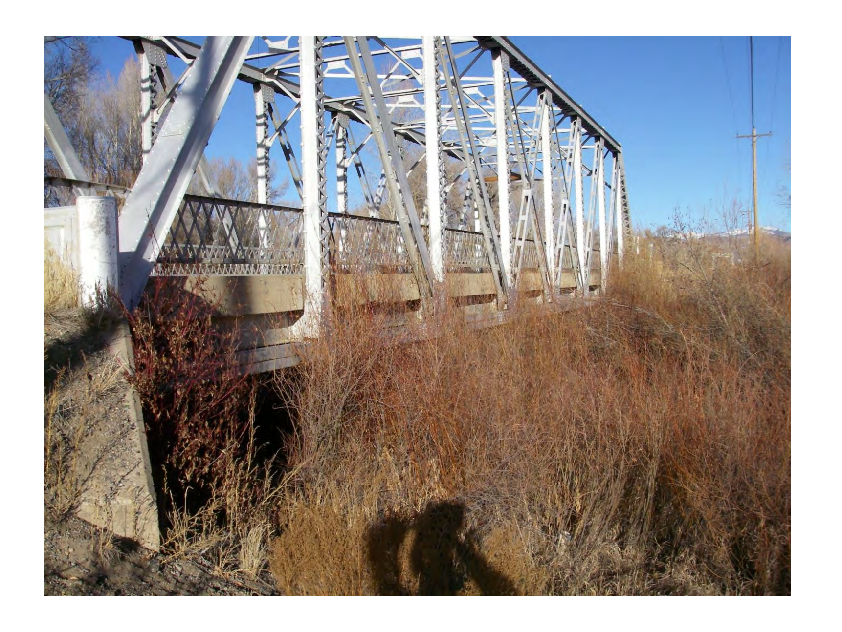
Gunnison River Bridge, Gunnison County, US Highway 50 Service Road, Steel Pratt Through Truss