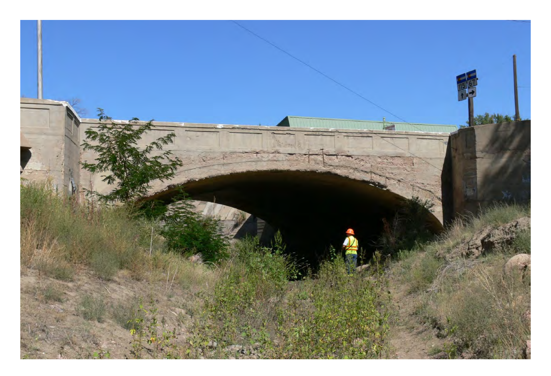
Main Street Bridge, Fremont County, State Highway 115, Concrete Arch Culvert