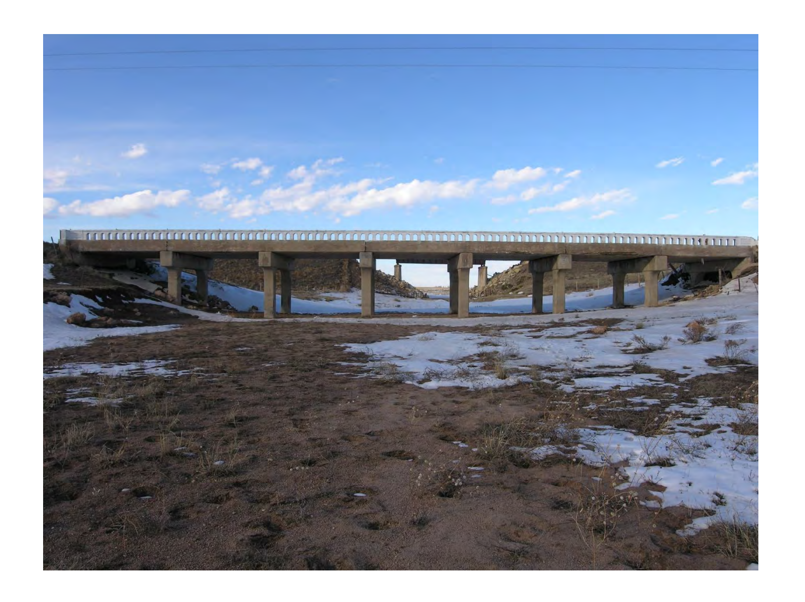
Spring Creek Bridge, Kit Carson County, US Highway 24, Concrete Slab