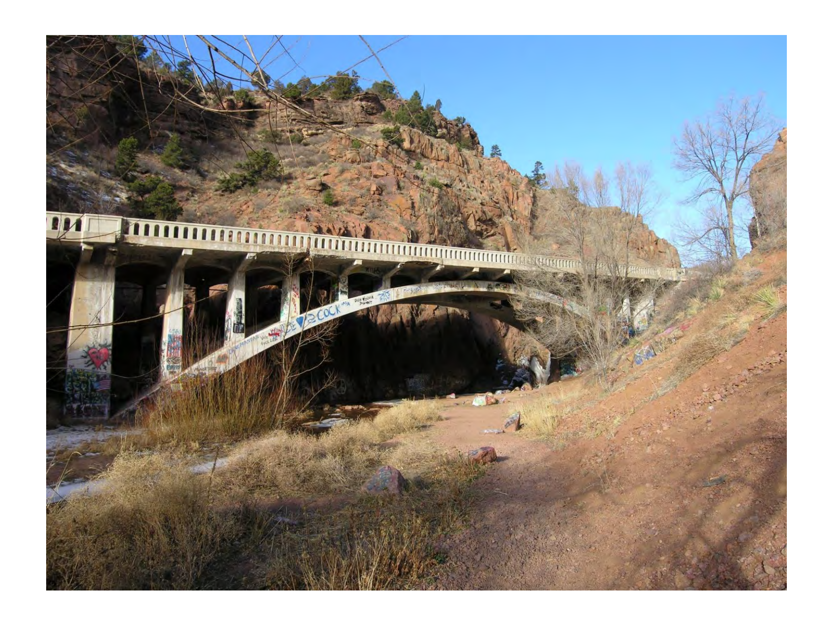
Fountain Creek Bridge, El Paso County, US Highway 24, Concrete Two Rib Open Spandrel Arch