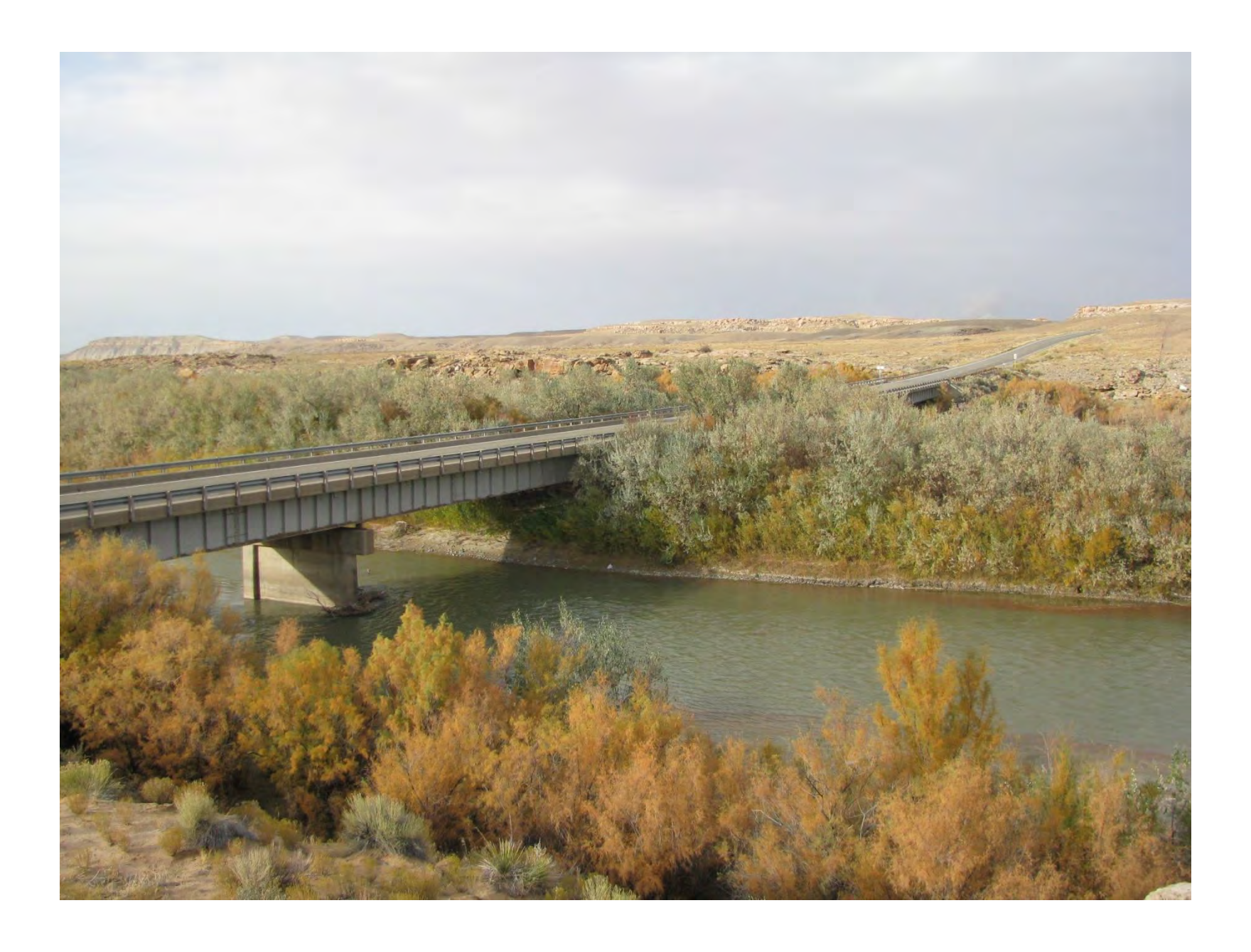
San Juan River Bridge, Montezuma County, IRR# US Highway 160, Welded Girder Continuous