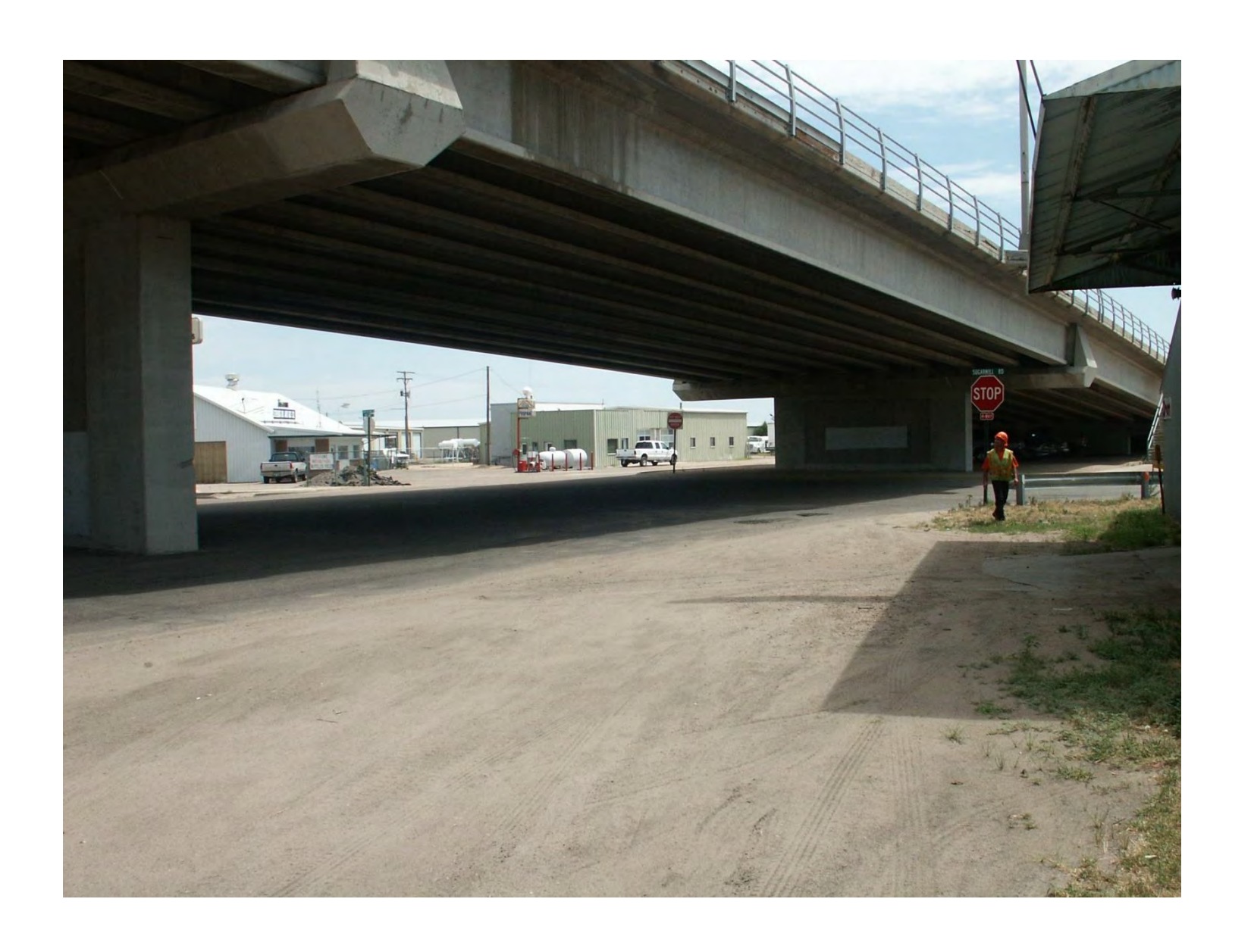
Sterling Viaduct, Logan County, US Highway 6, Concrete Prestressed Grider Continuous