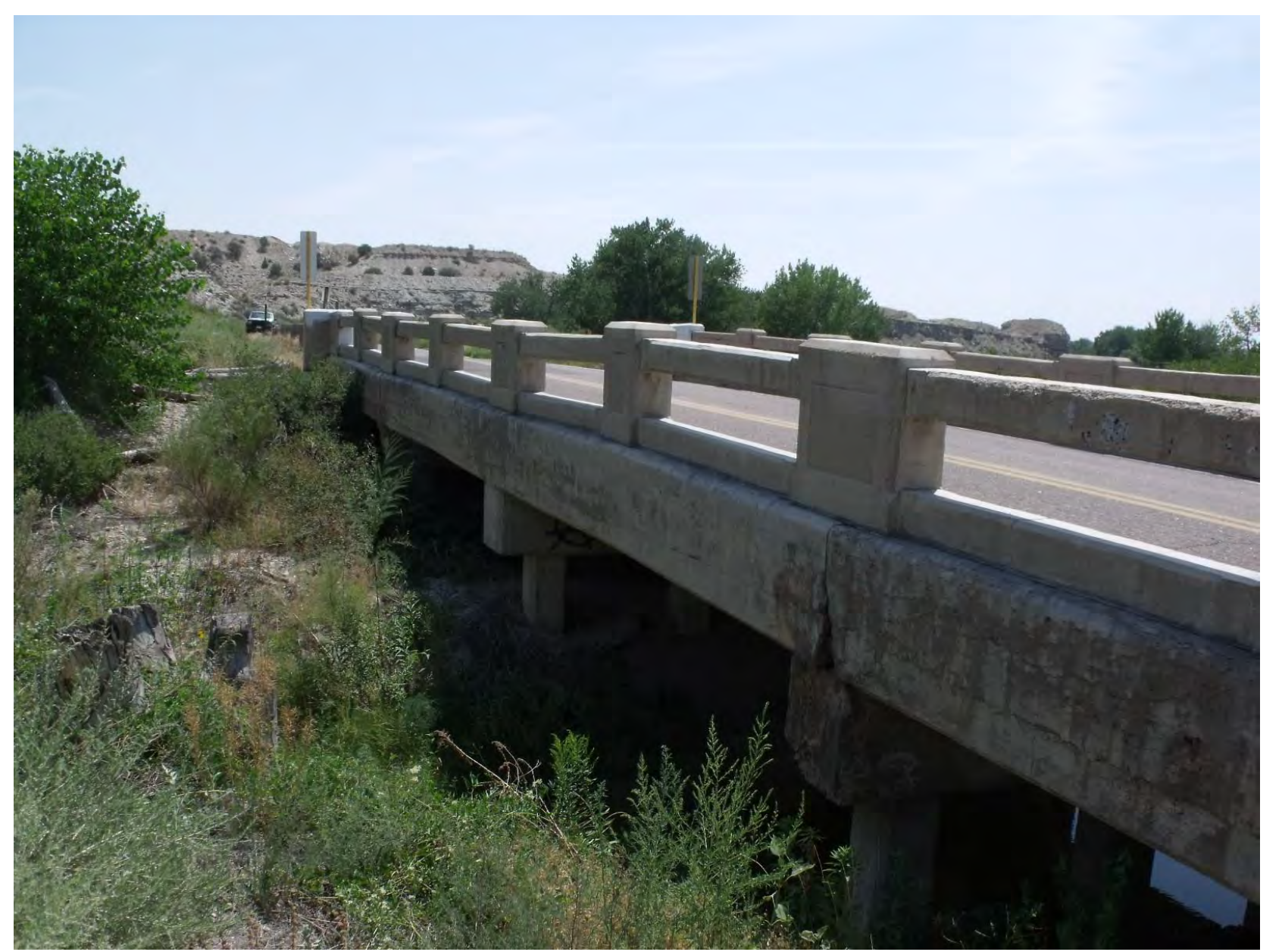
Bear Creek Bridge, Fremont County, State Highway 120, Concrete Slab