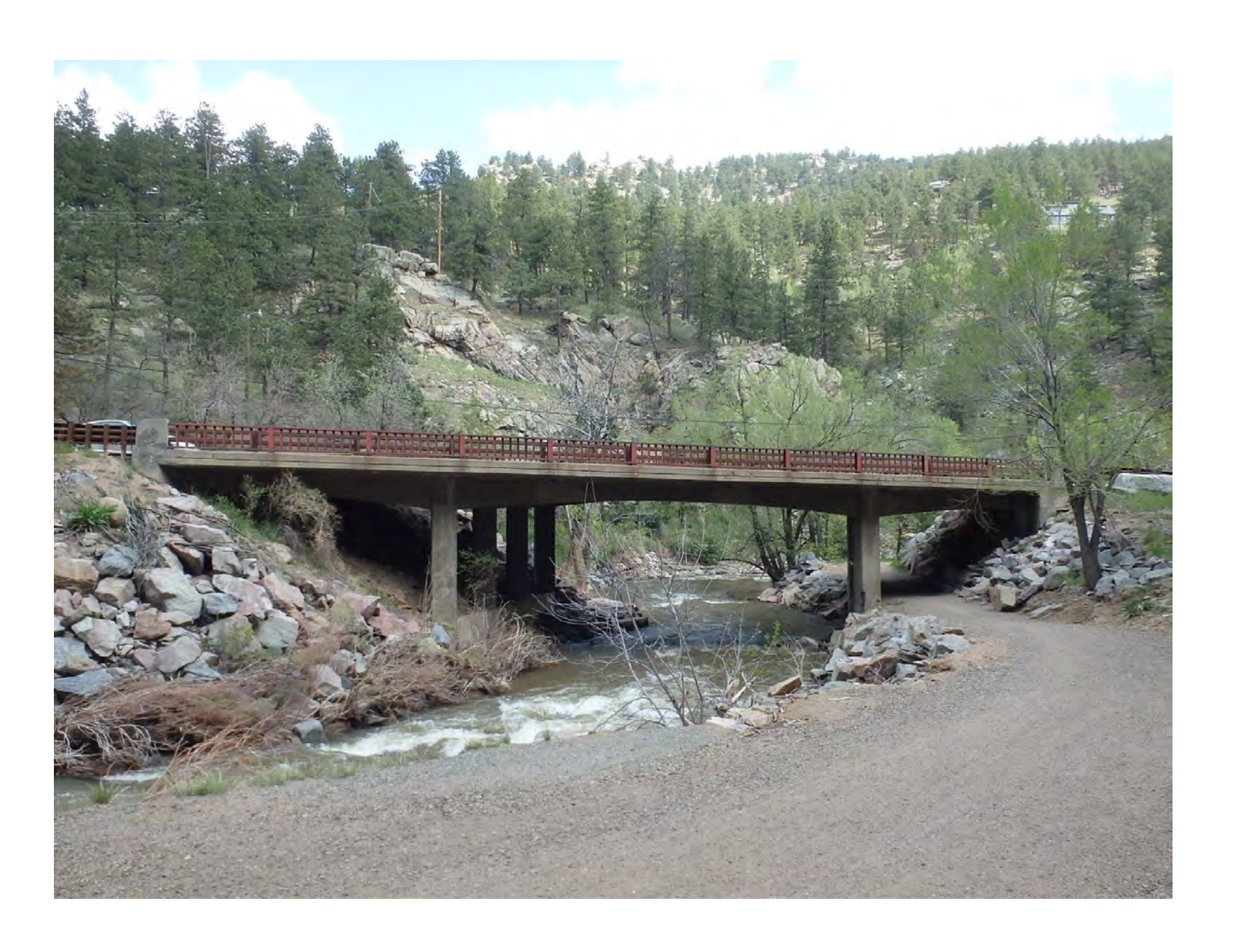
Boulder Creek Bridge, Boulder County, State Highway 119, Concrete Slab and Girder Continuous