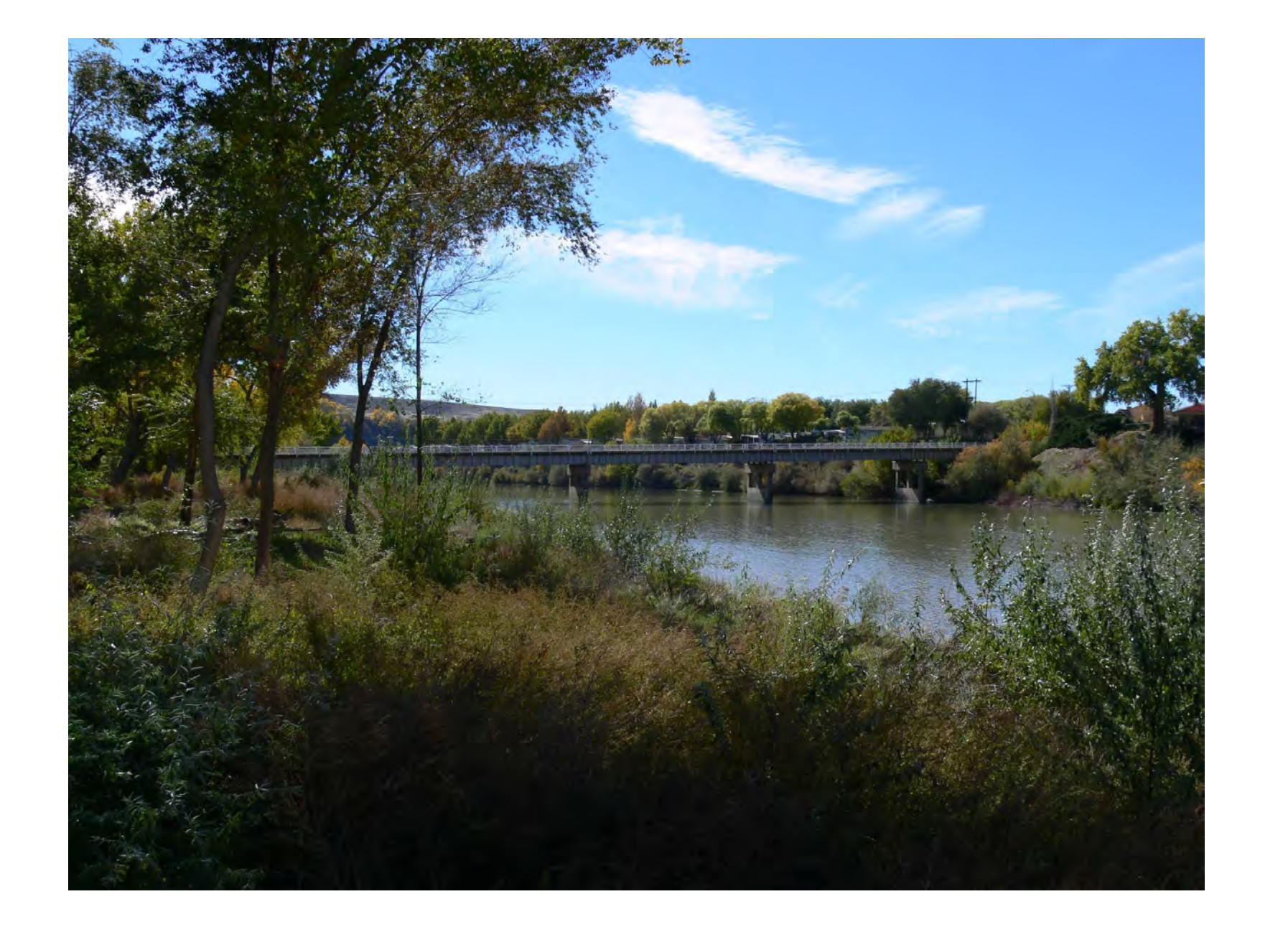
Grand Avenue Bridge, Mesa County, US Highway 6, Riveted Girder Continuous