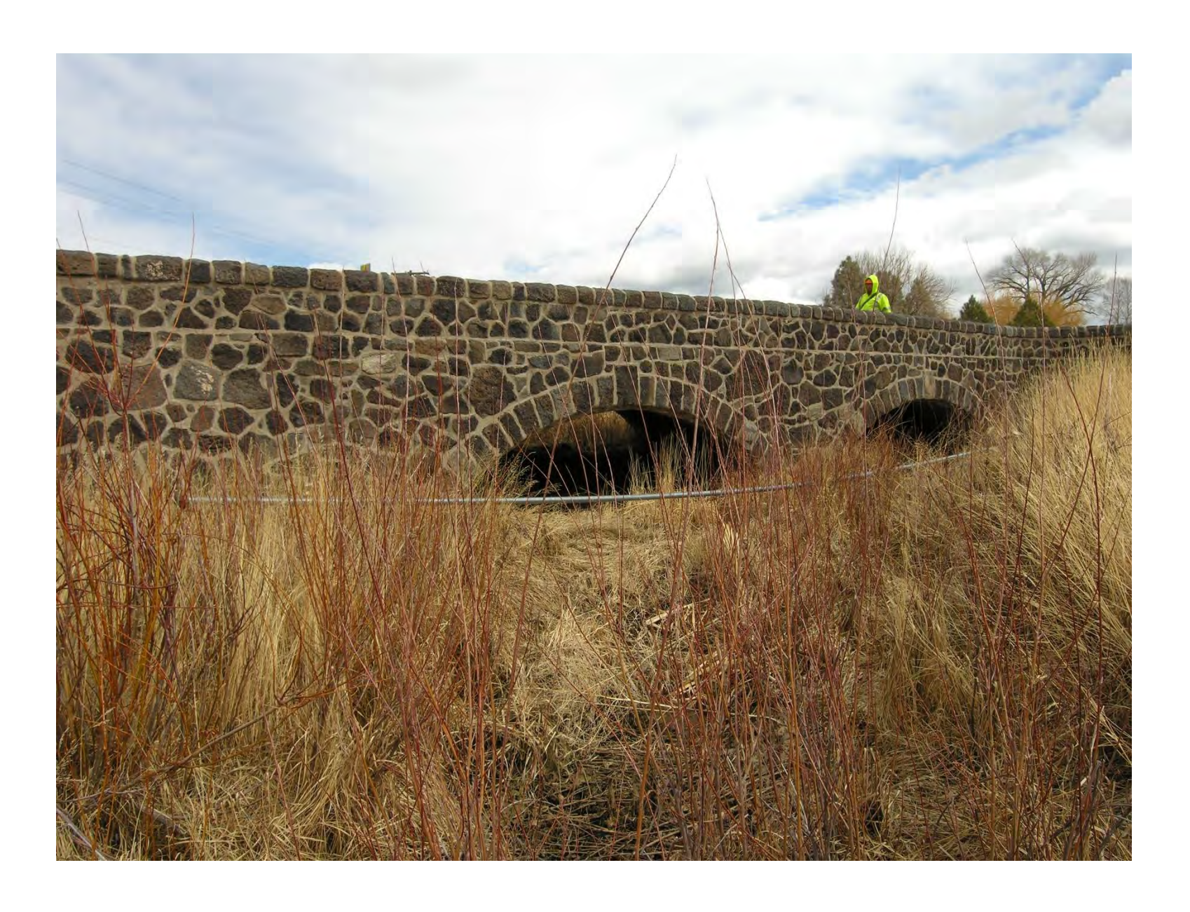
Rito Seco Creek Culvert, Costilla County, State Highway 142, Steel Arch Culvert/Multiplate Arch Culvert