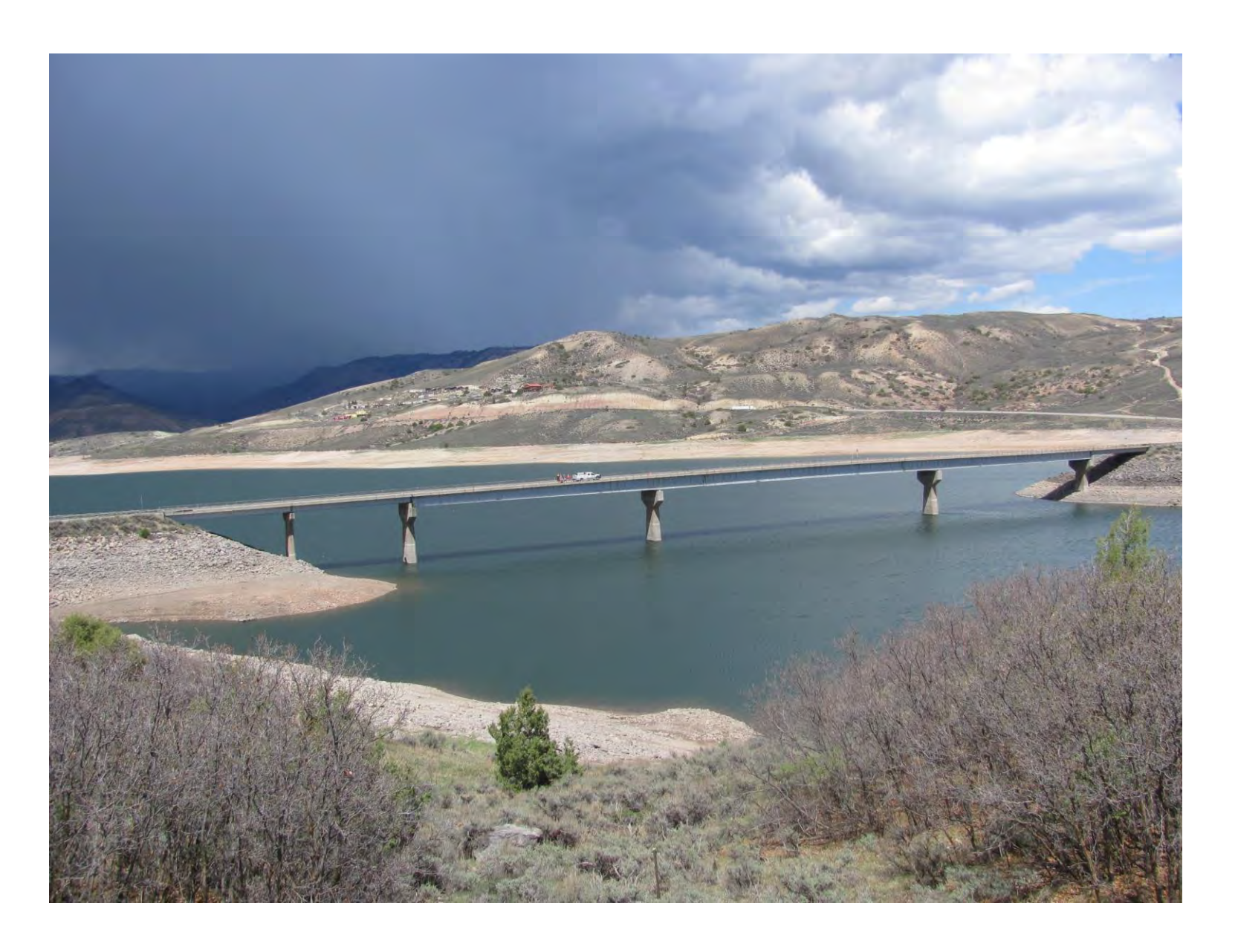
Lake Fork Bridge (Blue Mesa Reservoir), Gunnison County, US Highway 50, Welded Girder Continuous Cantilever