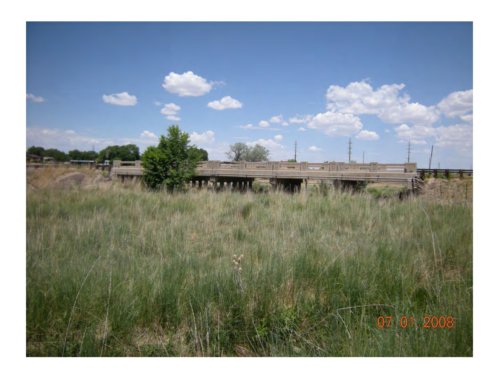
No name, Pueblo County, US Highway 50, Concrete slab