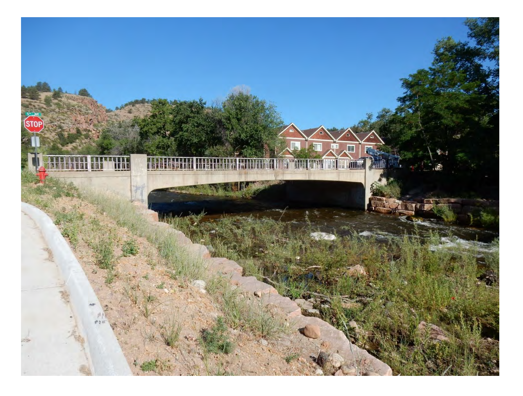
North St Vrain Creek Bridge, Boulder County, State HIghway 7, Concrete Rigid Frame