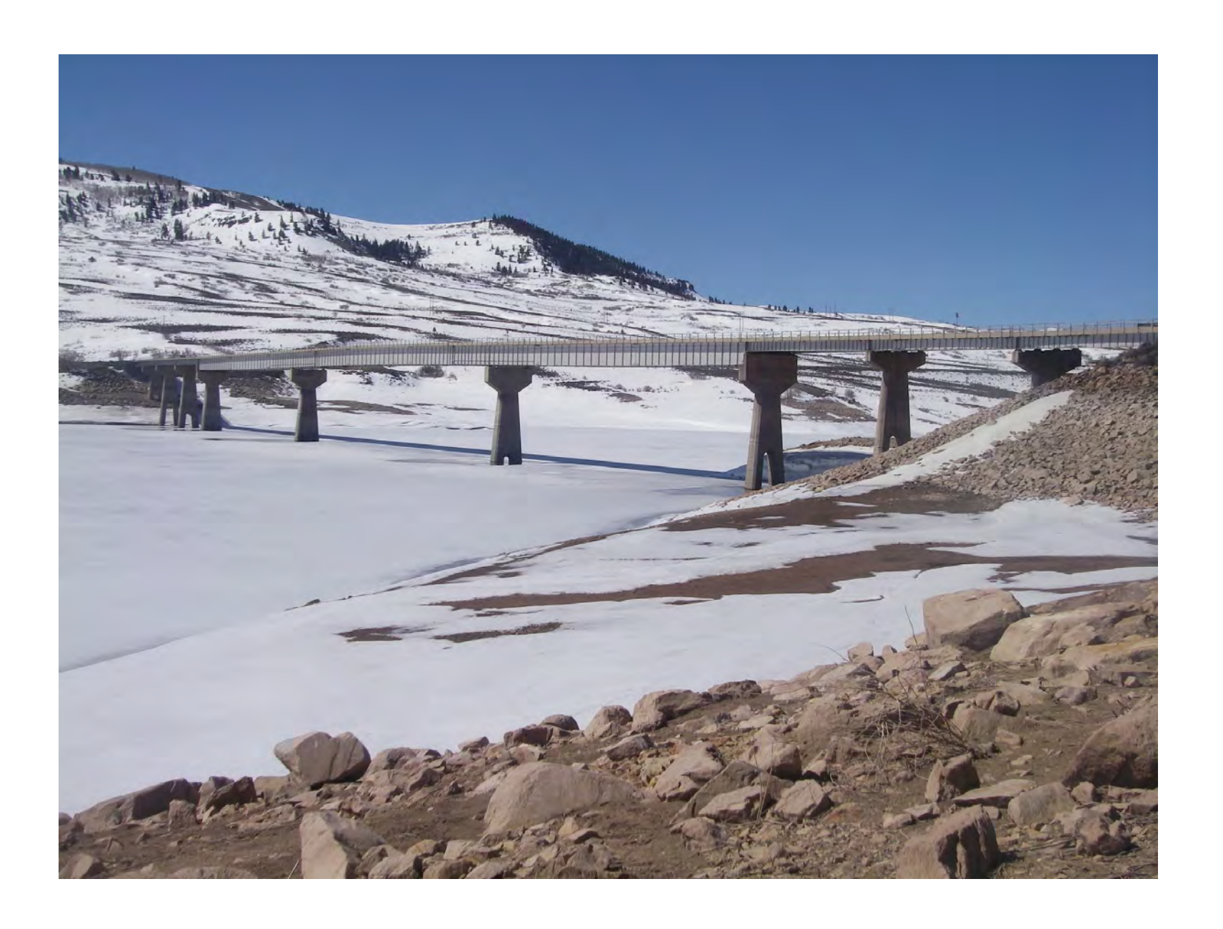
Blue Mesa Reservoir Bridge, Gunnison County, US Highway 50, Welded Girder Continuous and Composite