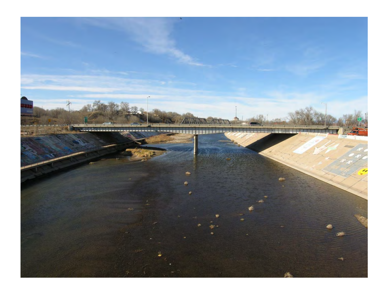
Arkansas River Bridge, Pueblo County, Interstate 25, Riveted Girder Continuous