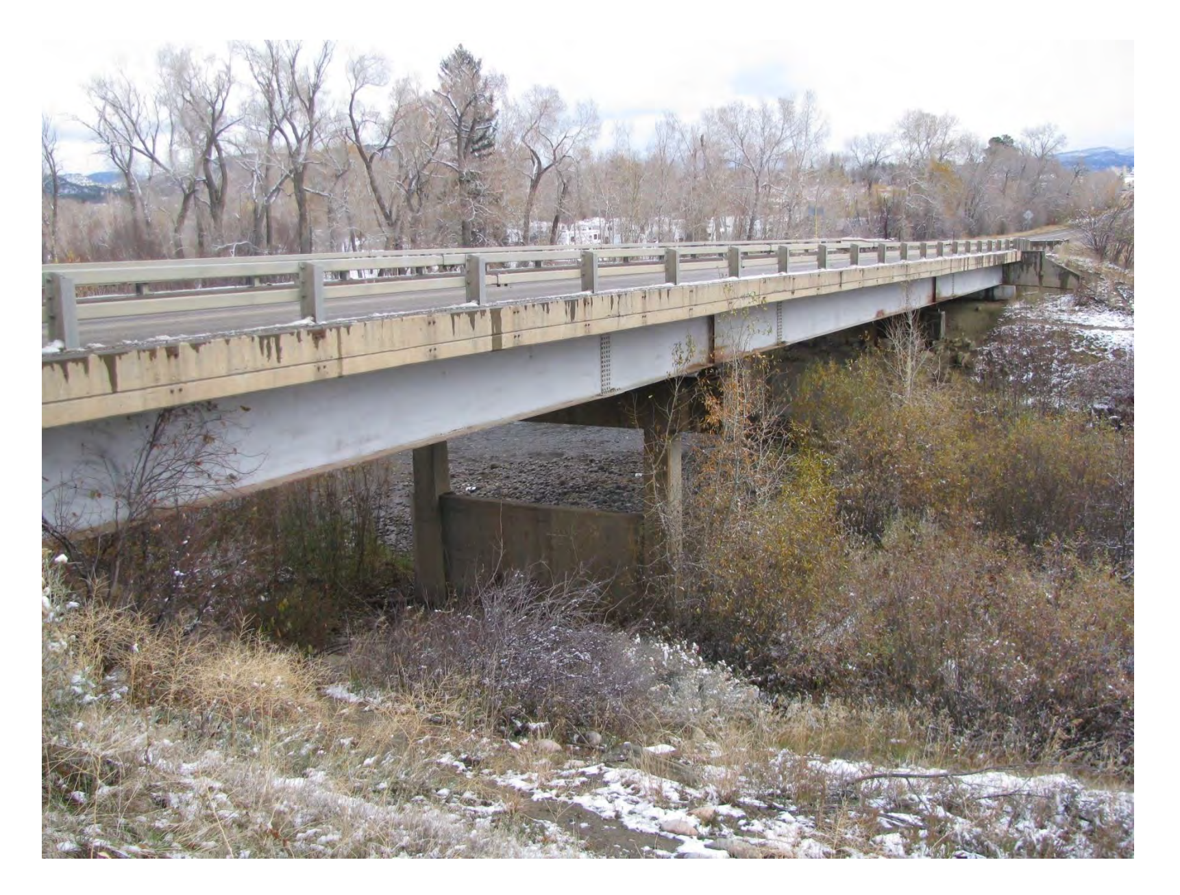
Los Pinos River Bridge, La Plata County, US Highway 160, Welded Girder Continuous