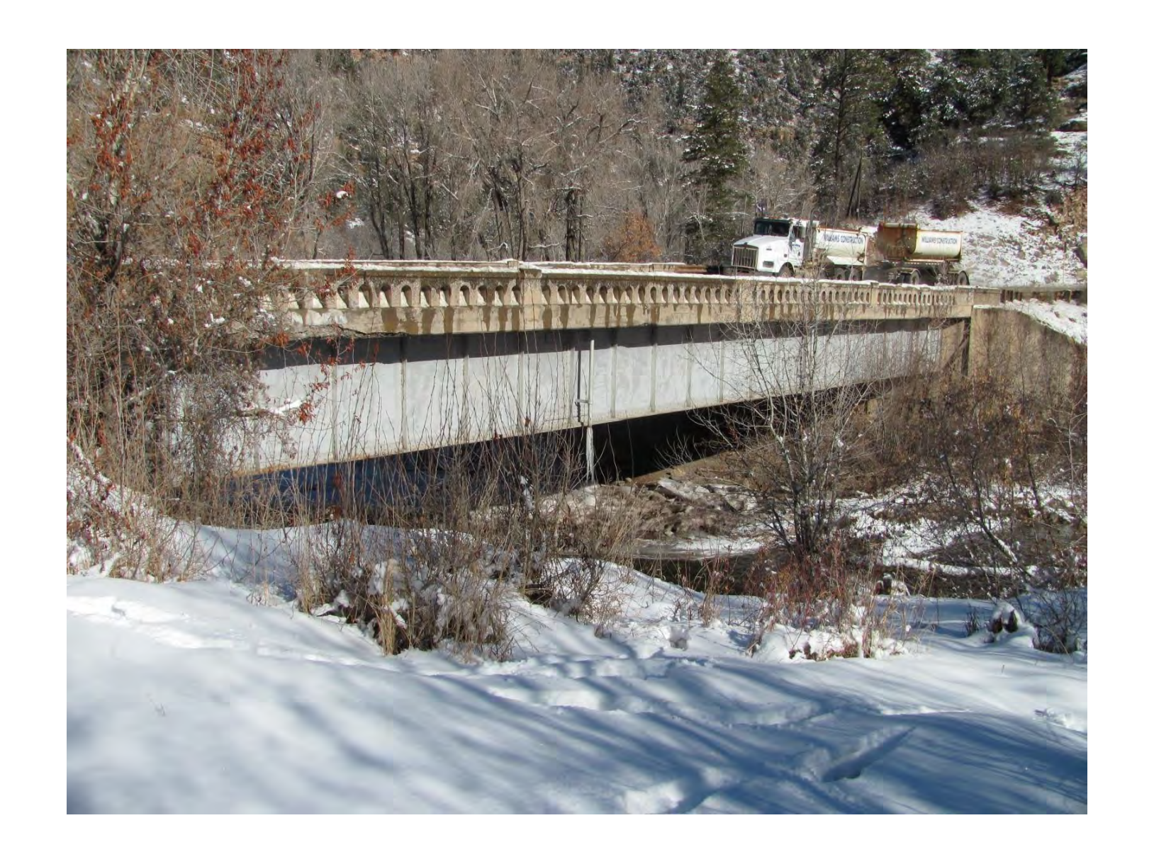
San Miguel River Bridge, San Miguel County, State Highway 145, Riveted Girder