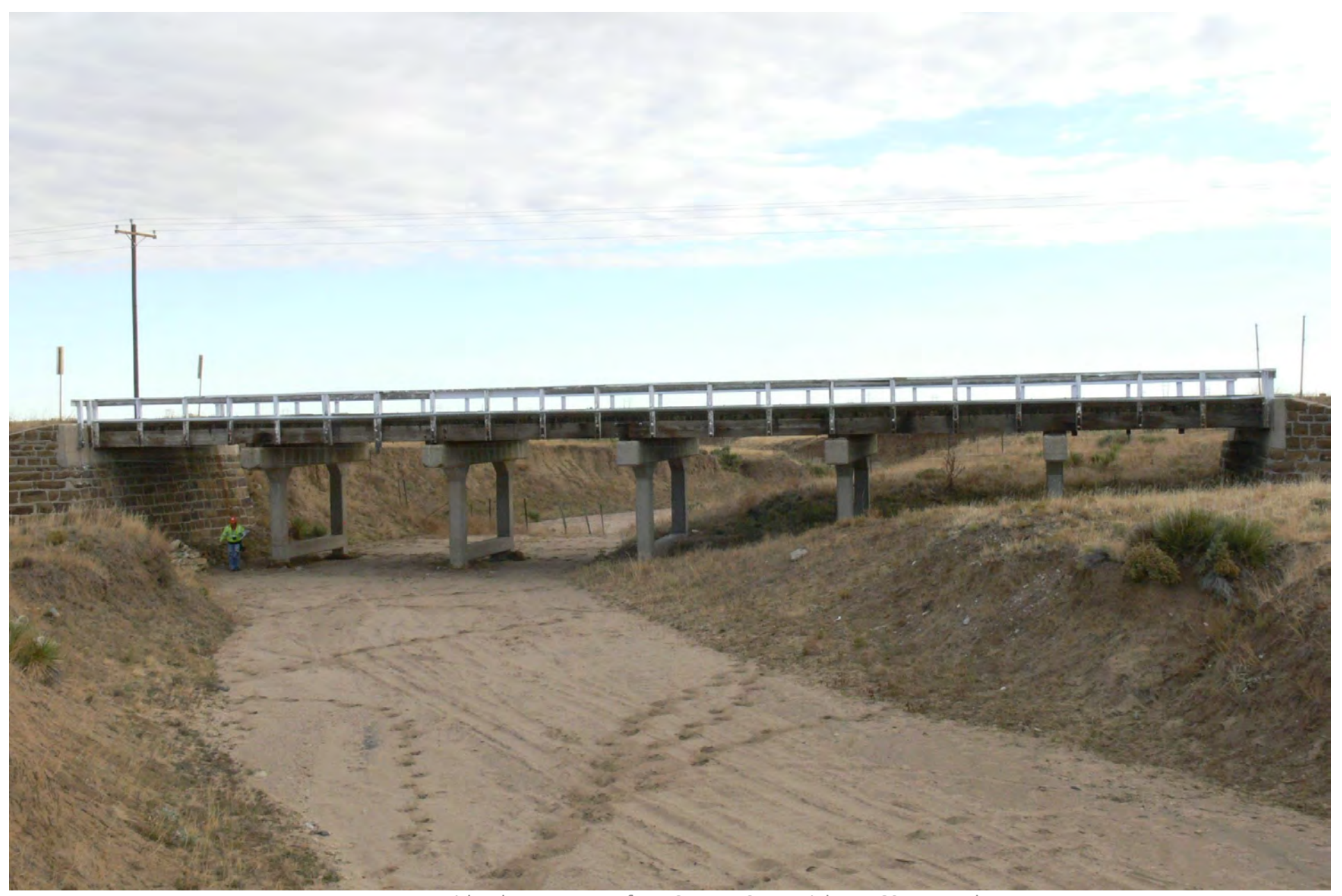
Maitland Arroyo, Huerfano County, State Highway 69, Treated Timber Stringer w/Timber Deck