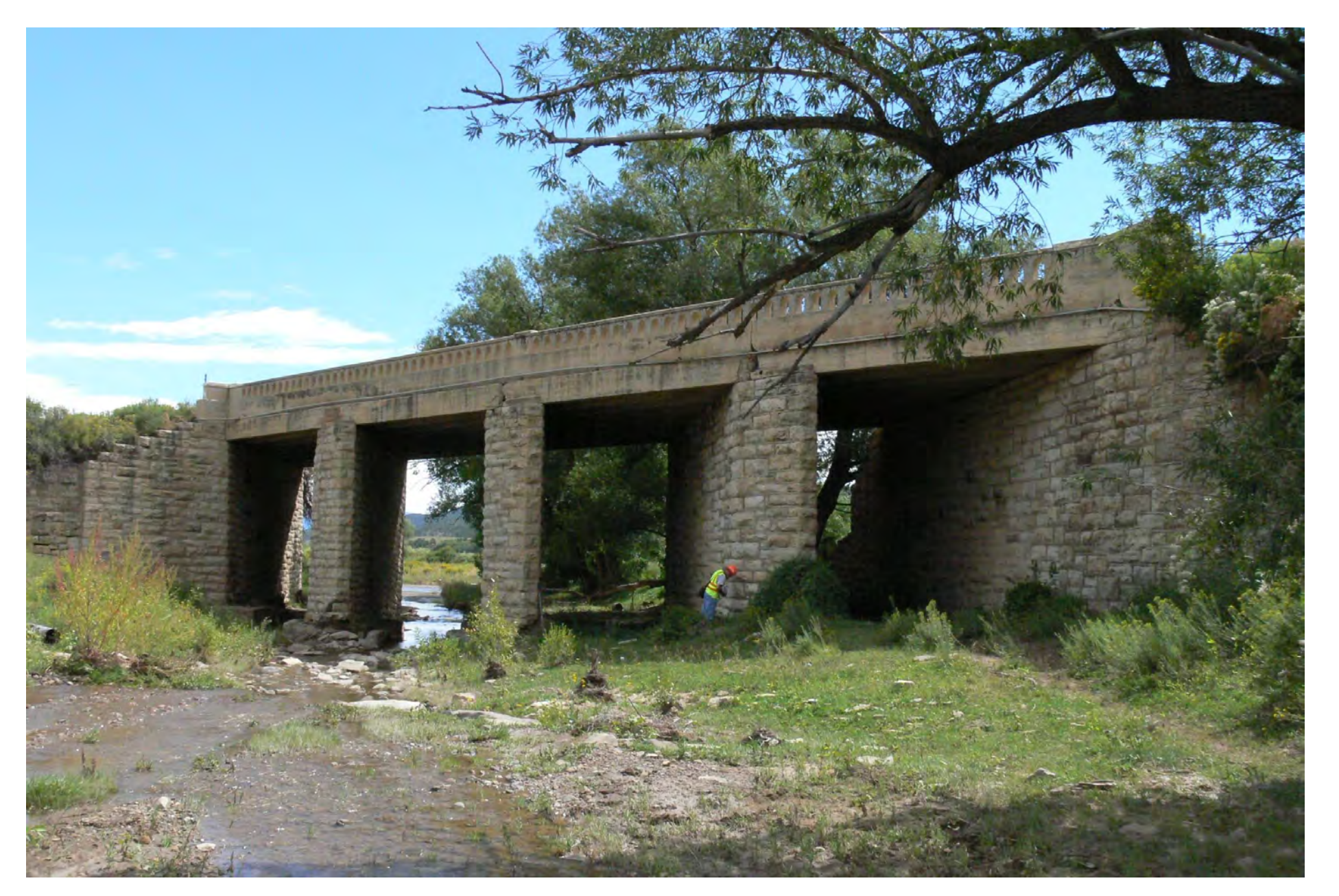
Zaracillo Canyon, Las Animas County, State Highway 12, Concrete Slab and Girder