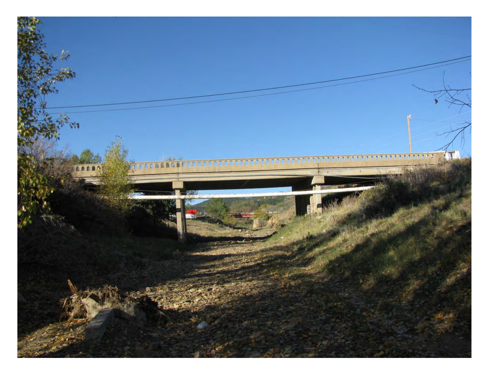
Gonzales Canyon Bridge, Las Animas County, Interstate 25, Concrete Slab and Girder