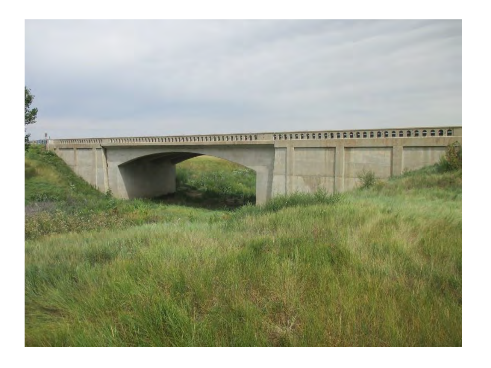
Plum Bush Creek Bridge, Washington County, US Highway 36, Concrete Rigid Frame