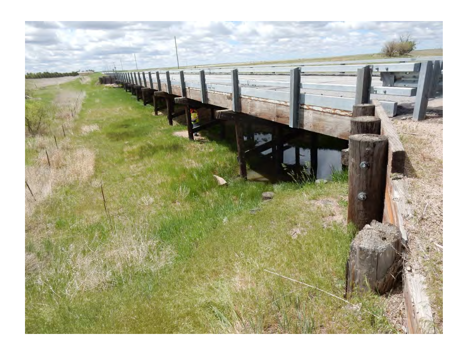
Sandy Creek Bridge, Phillips County, State Highway 59, Treated Timber Stringer with metal plank deck