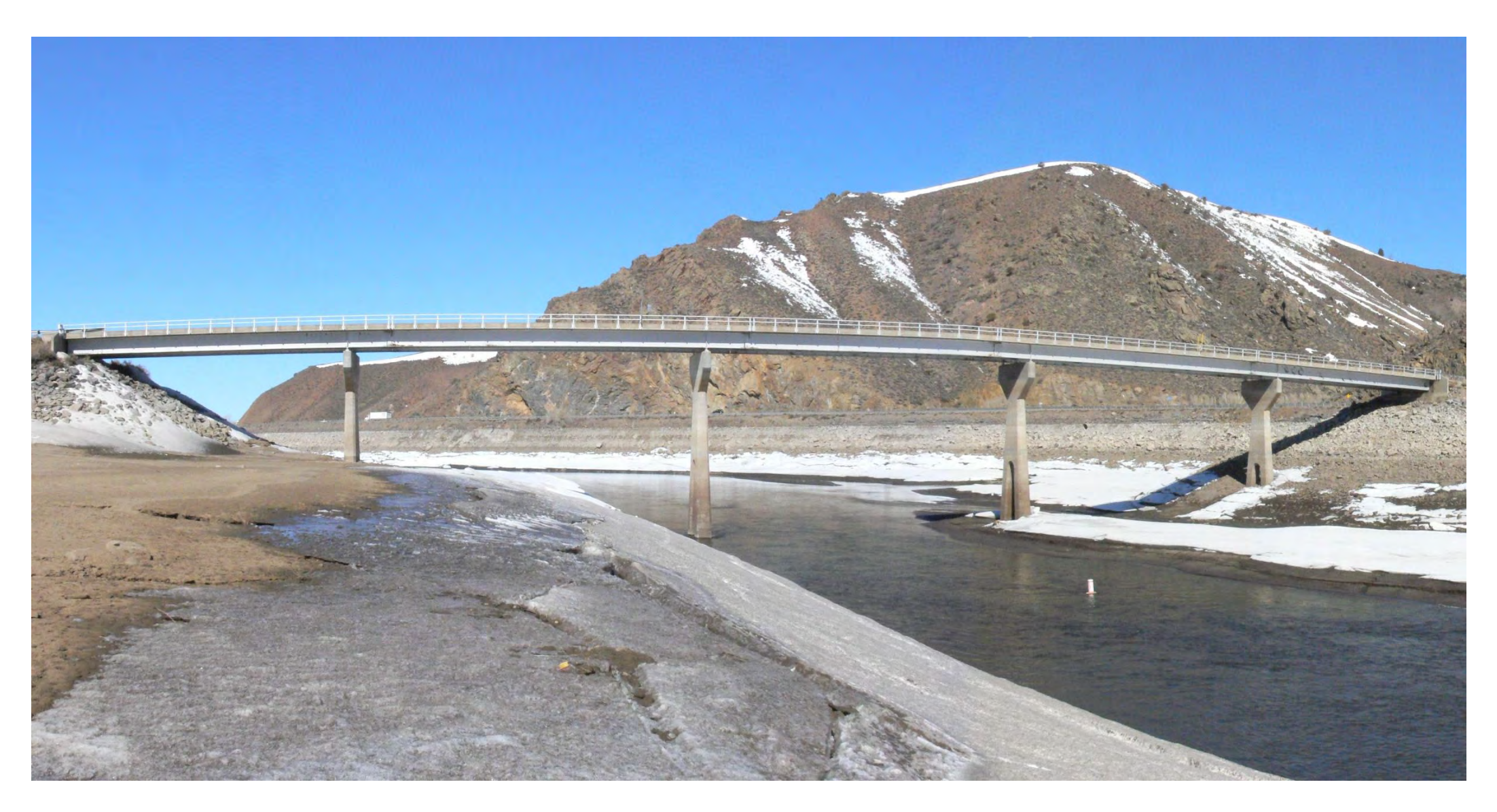
Blue Mesa Reservoir Bridge, Gunnison County, State Highway 149, Welded Girder Continuous and Composite