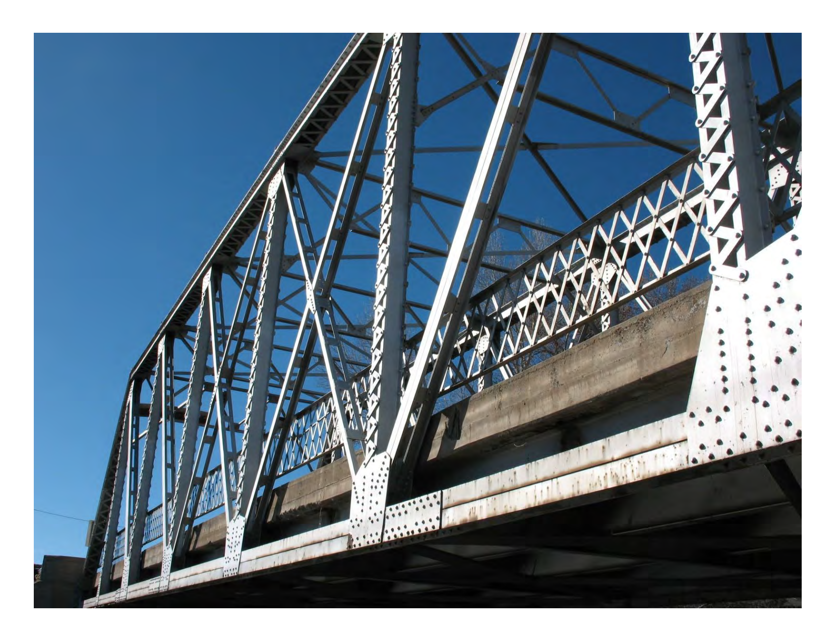
Gunnison River Bridge, Gunnison County, US HIghway 50 Service Road, Steel Pratt Through Truss