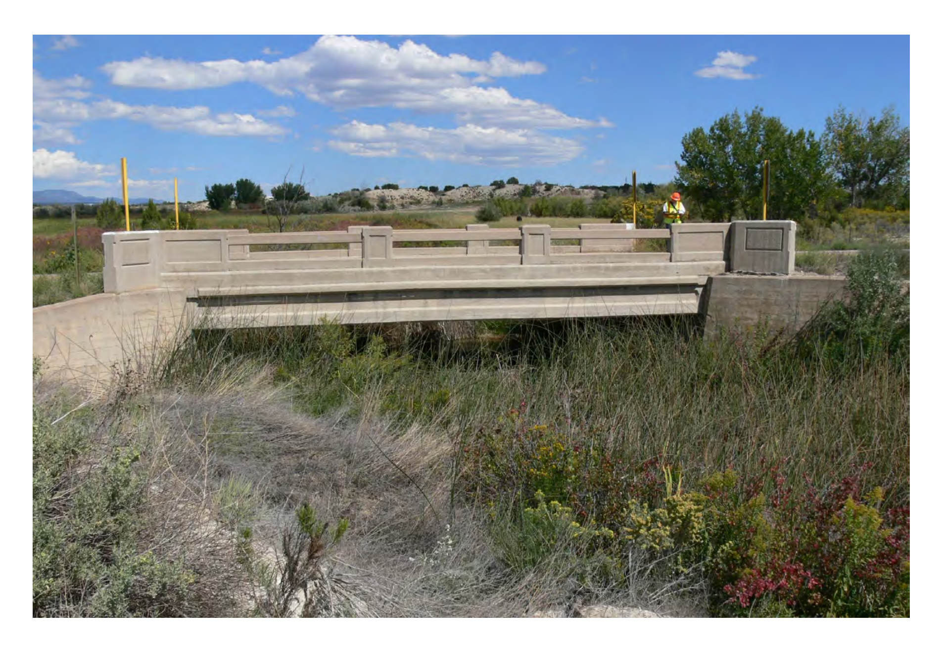
No Name, Fremont County, State Highway 120, Concrete slab and girder