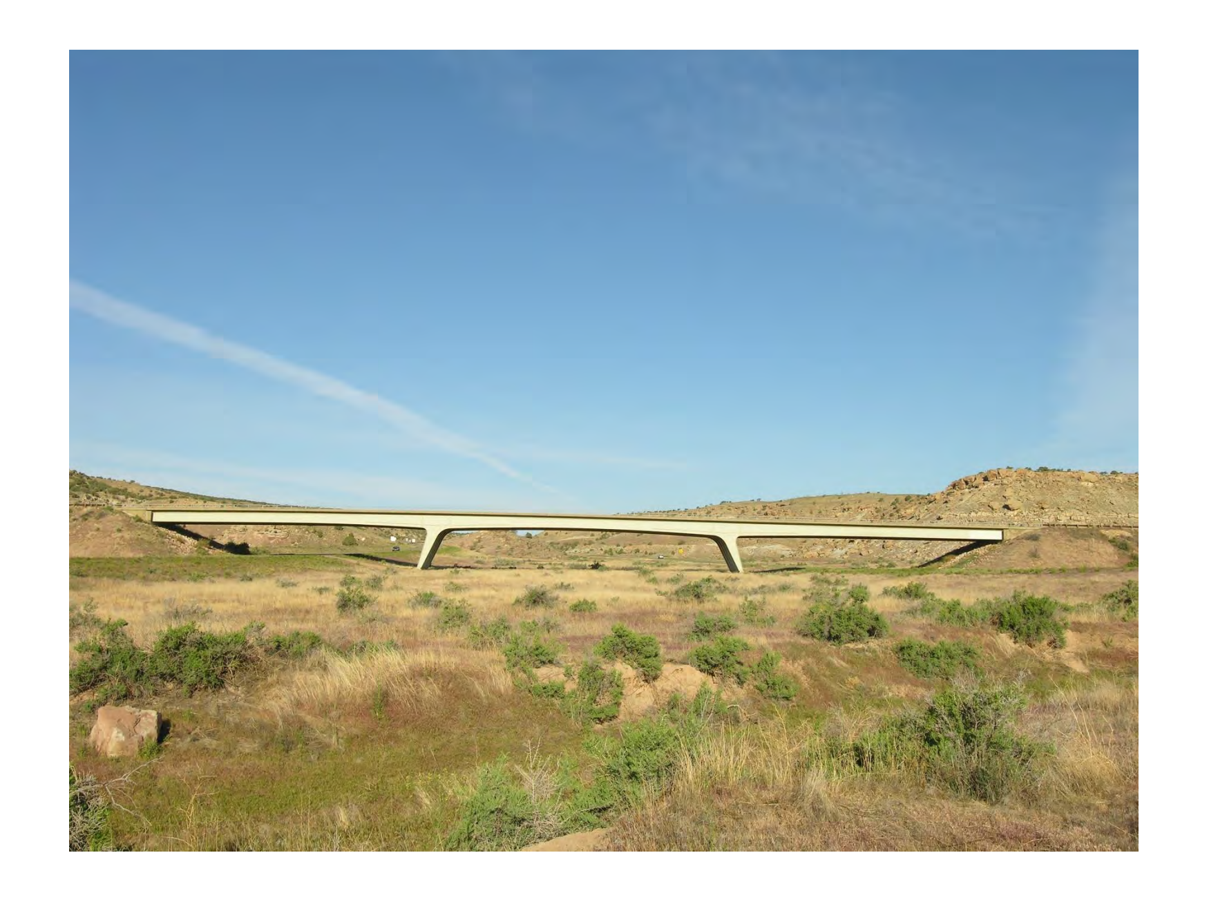
Rabbit Valley Interchange, Mesa County, County Road 60/Interstate 70, Steel Rigid Frame