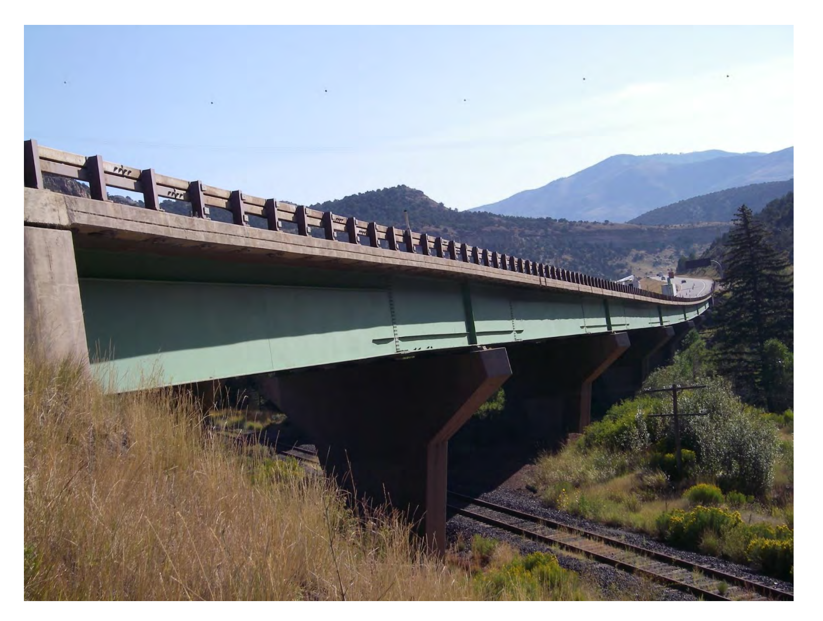
No Name, Eagle County, Interstate 70 Eastbound, Welded Girder Continuous and Composite