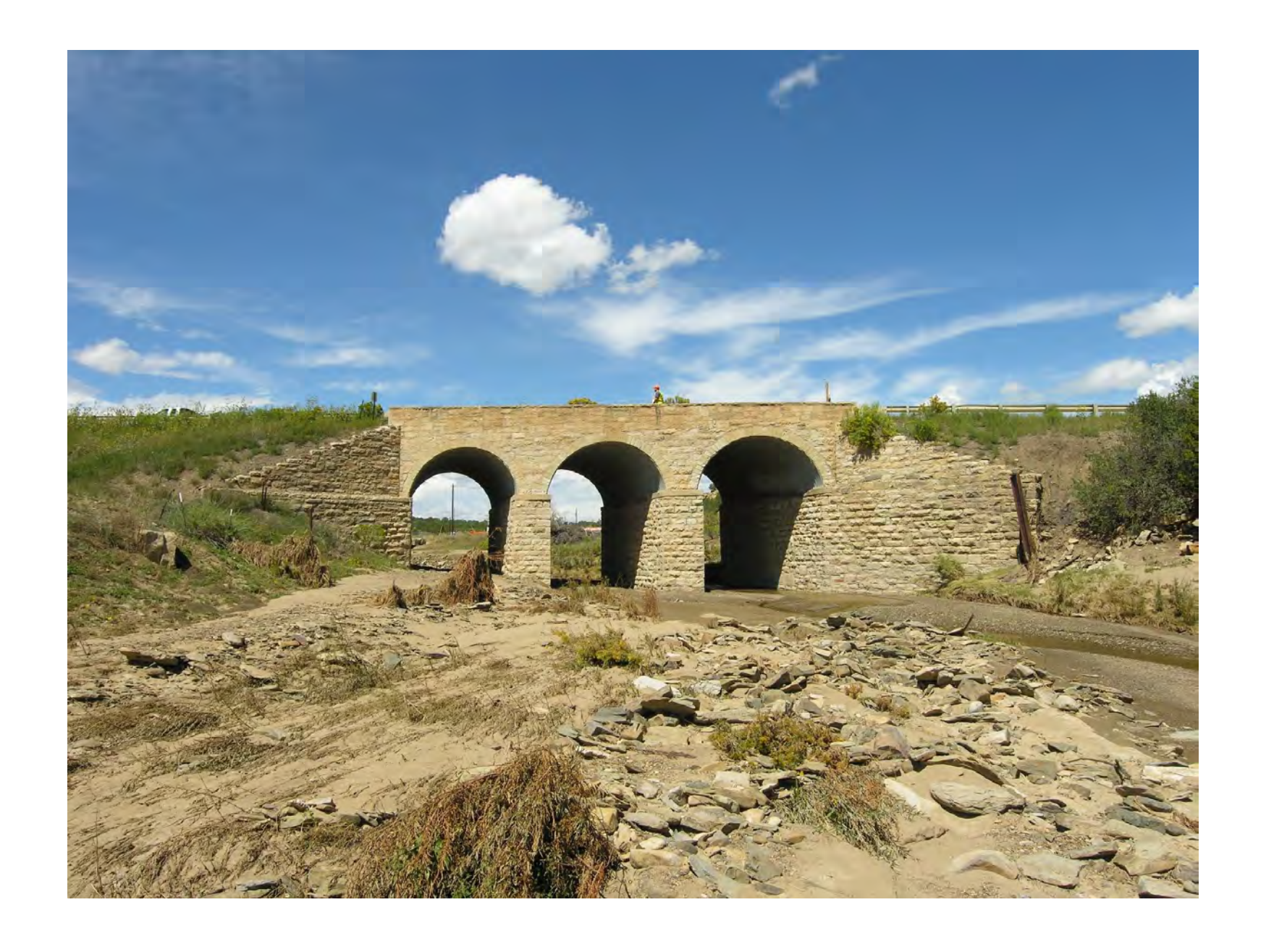
Burro Canyon Bridge, Las Animas County, State Highway 12, Steel Arch Culvert/Multiplate Arch Culvert