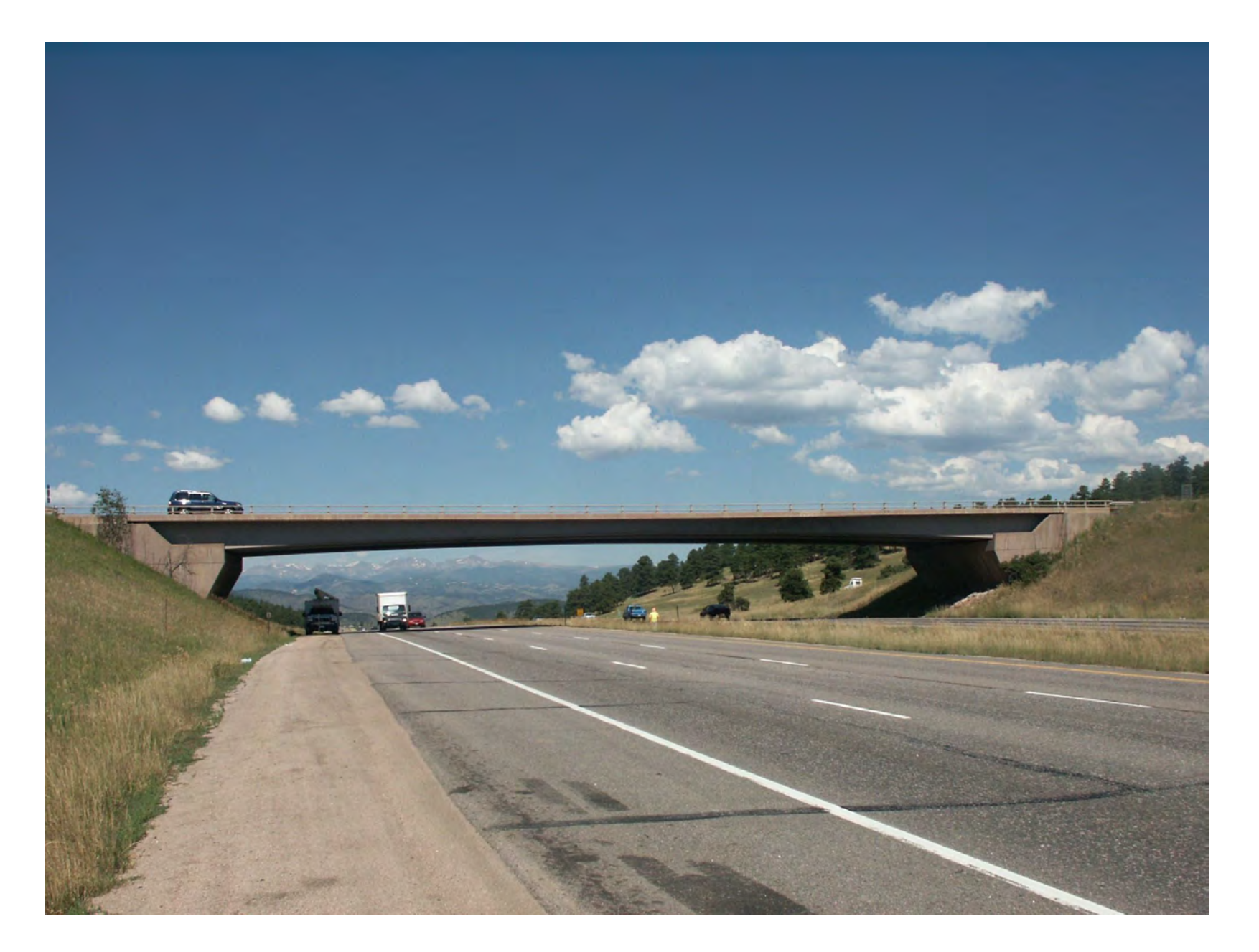
Genesee Park Interchange, Jefferson County, US Highway 40, Steel Box Girder Continuous