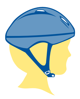
The correct fit

A crash, as well as age and normal wear and tear, will cause the foam of the bicycle helmet to become less effective. The soft foam fitting pads will compress and need to be replaced from time to time to ensure a snug fit. It is time to replace your helmet when it becomes too loose to tighten or it is several years old.