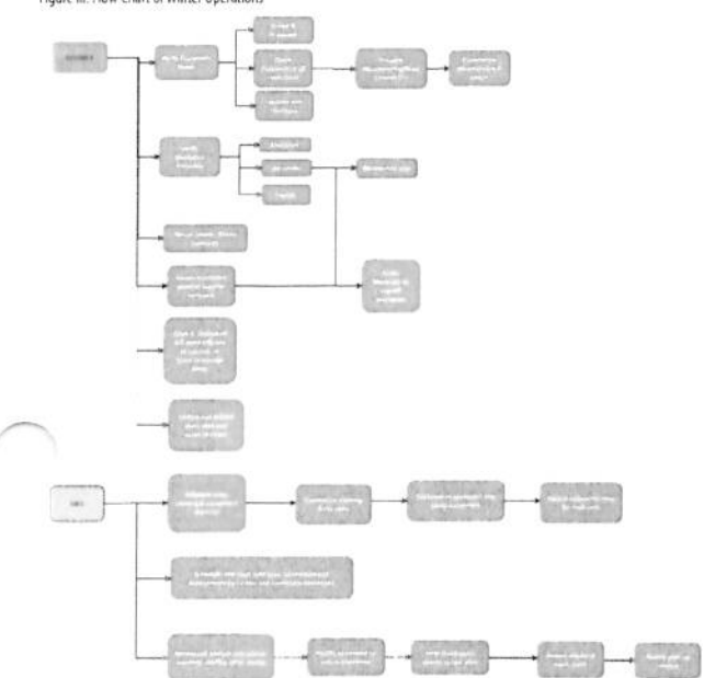
Figure iii: Flow Chart of Winter Operations