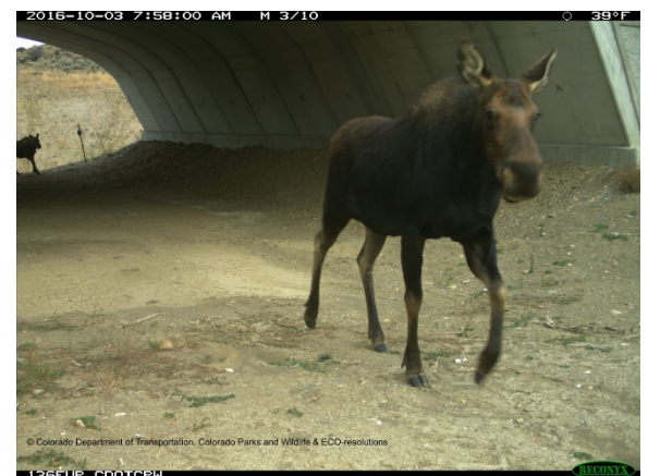
Images from Hwy 9