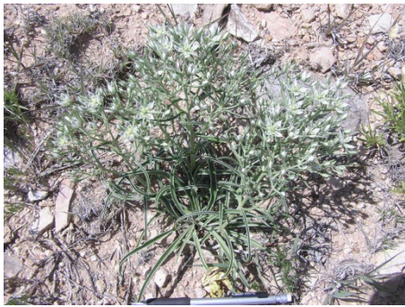
Close up of Frasera coloradensis by Jill Handwerk