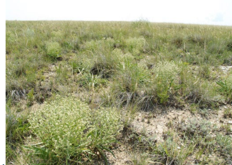
Habitat of Frasera coloradensis

Low sandy/sandstone breaks in grasslands, northerly aspects in between rocks or just below them; shallow slopes. Associated with surface outcrops or shallow-to-bedrock occurrences of Cretaceous rock formations, including Greenhorn limestone, Graneros shale and Dakota