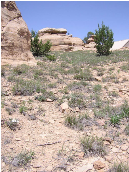
Habitat of Frasera coloradensis