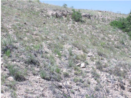
Habitat of Frasera coloradensis