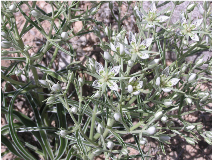
Close up of Frasera coloradensis by Jill Handwerk