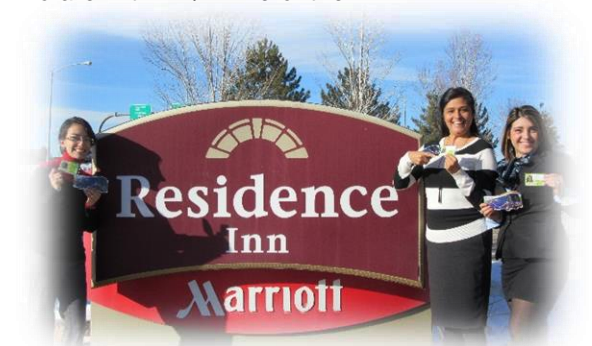
Residence Inn Employees receive their 2016 passes.