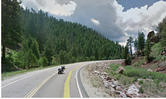
Highway 67 - Safety improvements benefitting motorcyclists and motorists will be made on this stretch of highway.

Heat Was On - Law enforcement agencies across the state cited 1,184 impaired drivers during the Colorado Department of Transportation's (CDOT) The Heat Is On Labor Day driving under the influence (DUI) enforcement period, Aug. 18-Sept. 5. This number represents an increase from the same period last year, which reported 964 DUI arrests.