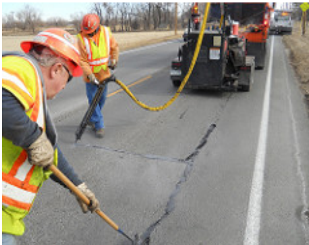
Crack Sealing - Workers seal cracks on Highway 7 to help preserve the pavement.

Chip seal combines one or more layers of asphalt with one or more layers of fine aggregate, and crack seal is sealing pavement cracks with flexible rubberized asphalt. The rubberized asphalt bonds to the crack walls and moves with the pavement. Both chip seal and crack seal make pavements last longer.