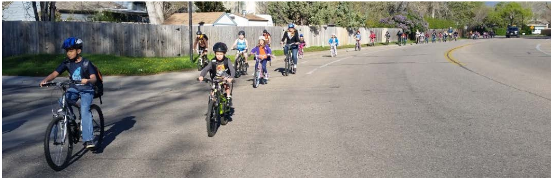
School Bikers – Children bicycle to school in a group, one of many biking and walking activities the CDOT Safe Routes to School tries to encourage.

Strategic Plan for Biking and Walking to School - CDOT recently completed a 2017-2022 Safe Routes to School Strategic Plan to guide the department's efforts in increasing the number of children bicycling and walking to and from school. The more children who engage in such active transportation, the healthier they are. The fewer children who are dropped off and picked up from school by private vehicles, the less congestion around schools and the cleaner the air.