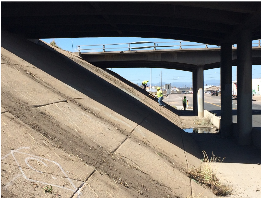
Slope Cleaning – A crew of formerly incarcerated prisoners cleans up the slope paving on one of the bridges in CDOT Region 1 in the Denver metro area.

While the former prisoners are working primarily on bridges, they're also picking up litter, removing clutter left behind by homeless persons, cleaning off graffiti, controlling vegetation, and cleaning vehicles.