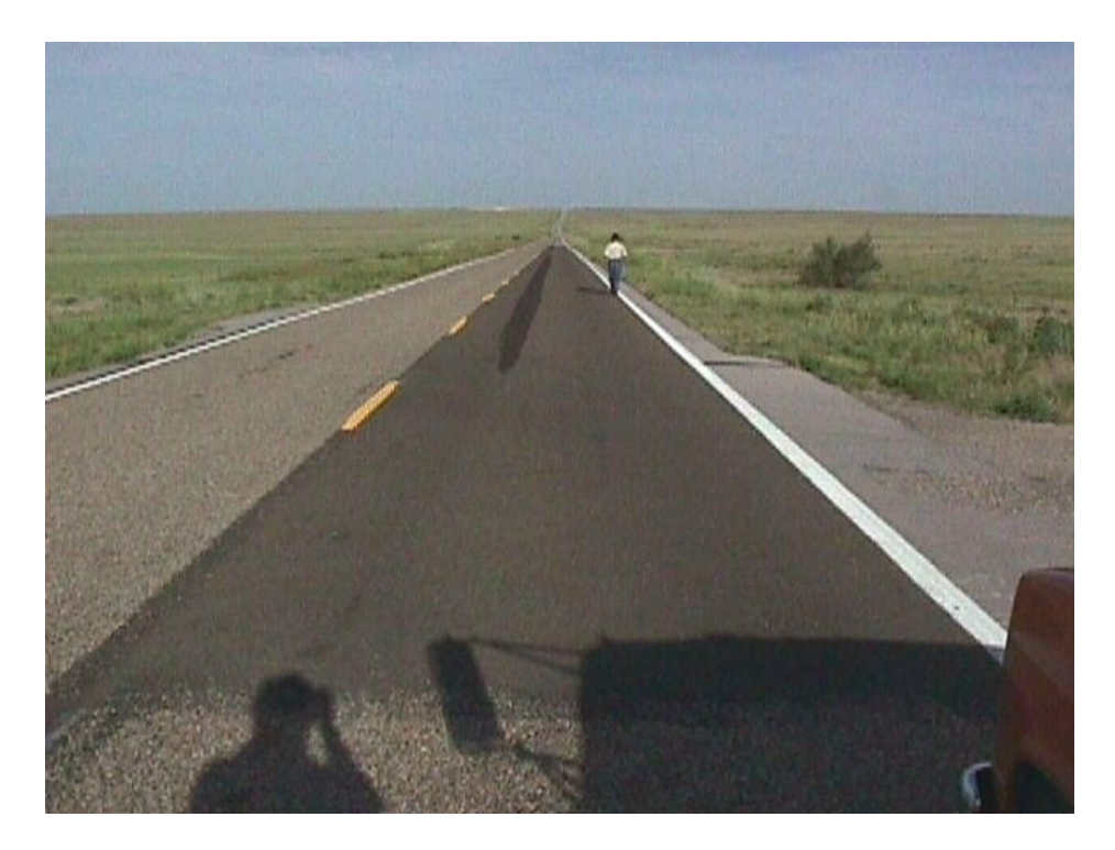
Figure 3. The light weight chip section at the east end of the site. The right lane is the light weight chip seal. The dark patch in the left wheel path is water left by the skid testing equipment.