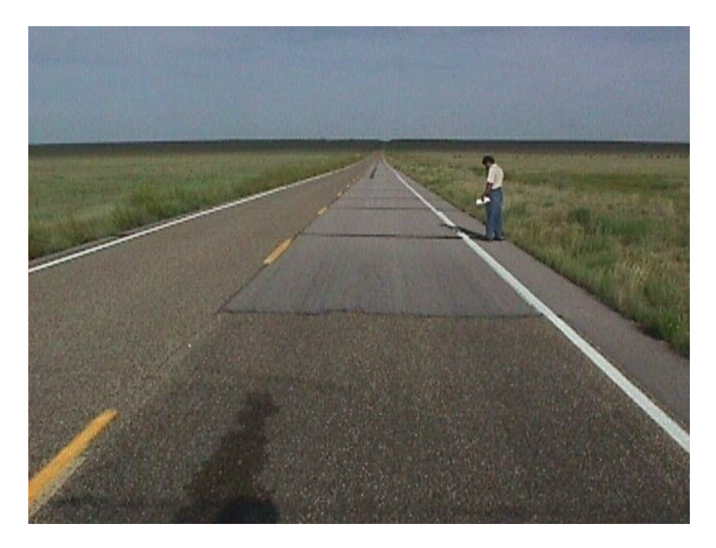
Figure 1. Looking west from the fog sealed section into the control. The dark stripe next to the figure is a sealed crack. The dark patches in the left wheel path are water where the skid tester had just finished testing.