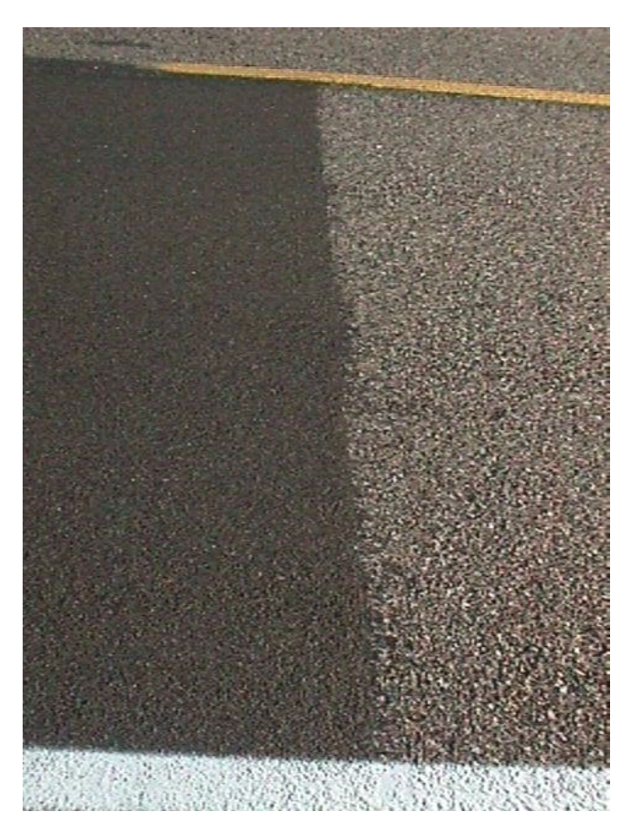
Figure 4. The transition from light weight to standard weight chips. Light weight chips are the dark area on the left of the picture. To the right side and in the far lane are standard chips.