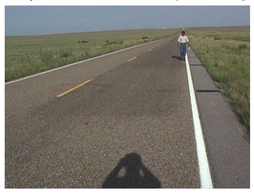
Figure 2. The fog seal section starts where the pavement is darker. The dark stripes on the shoulder are seals applied to transverse cracks before the chip seals were placed.

Figure 1. Looking west from the fog sealed section into the control. The dark stripe next to the figure is a sealed crack. The dark patches in the left wheel path are water where the skid tester had just finished testing.