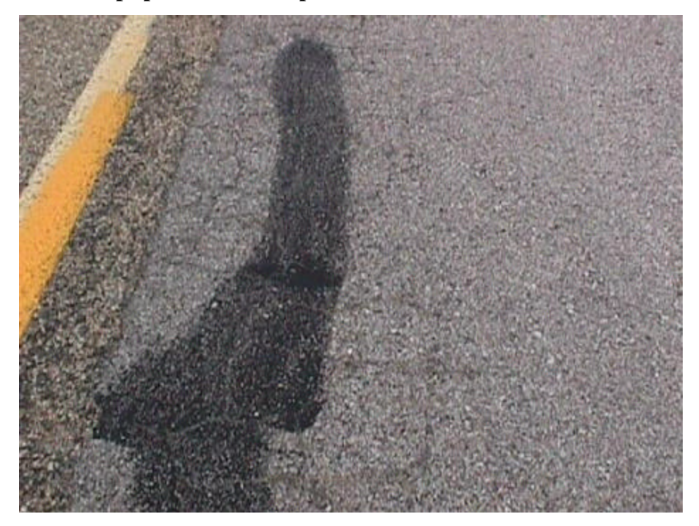
Figure 6. Block cracking is developing in the control section near the skip stripe. The longitudinal crack just to the right of the yellow stripe appears to be the construction joint. The dark patch is old crack seal material.

These are loose chips piled on the old pavement surface with a dime to show their size.