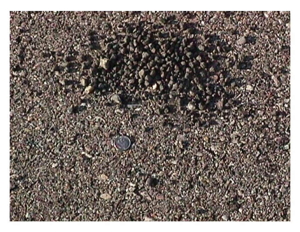
Figure 5. A handful of the light weight chips.

These are loose chips piled on the old pavement surface with a dime to show their size.