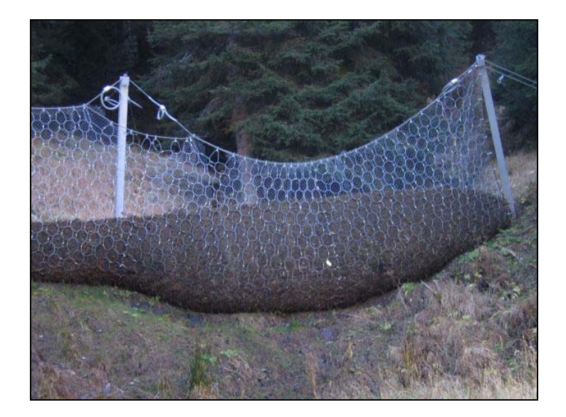
Figure 3 – The use of a high tensile-strength ring net to contain a debris flow