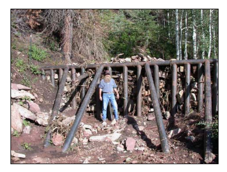
Figure 4 – A debris rack above Lemon Dam (near Durango, CO) successfully contained coarse material from a debris flow after the Missionary Ridge Fire of 2002 (from Florida Water Conservation District, 2003).

Finally, debris flows and floods may be passed directly under the road by the use of oversized culverts or bridges. The primary drawback to this approach is the difficulty in predicting the flow rate or volume that will occur in the event of a debris flow (Reihsen and Harrison, 1971). In the case of a bridge crossing, it is vital to place piles or abutments well above the anticipated level of flow because of the high scour potential of debris flows. Culverts must be maintained regularly and cleaned of material after an event to maximize their ability to pass large volumes of debris.