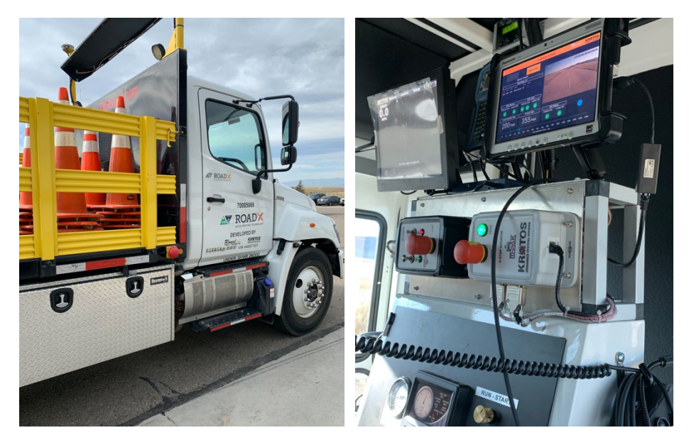
Figure 2. E-stop button outside of ATMA (left) and inside lead vehicle (right)

The ATMA is equipped with emergency stop ("e-stop") buttons along the outside of the ATMA vehicle, as well as inside the lead vehicle, see Figure 2. When one of these emergency stop buttons is pressed, the engine in the ATMA completely turns off, bringing the vehicle to a stop.