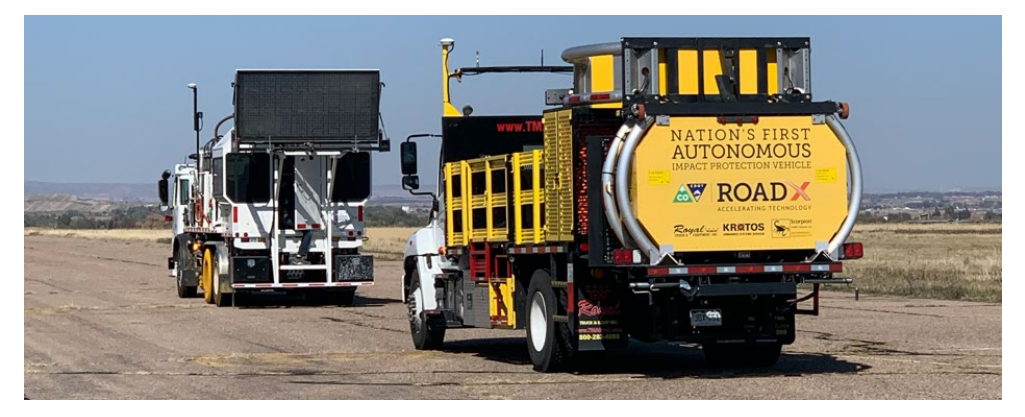
Figure 1. CDOT's lead vehicle (left) and ATMA follow vehicle (right).

operates by following a lead vehicle that transmits high-accuracy positioning, speed and heading to the ATMA follow vehicle, see Figure 1.