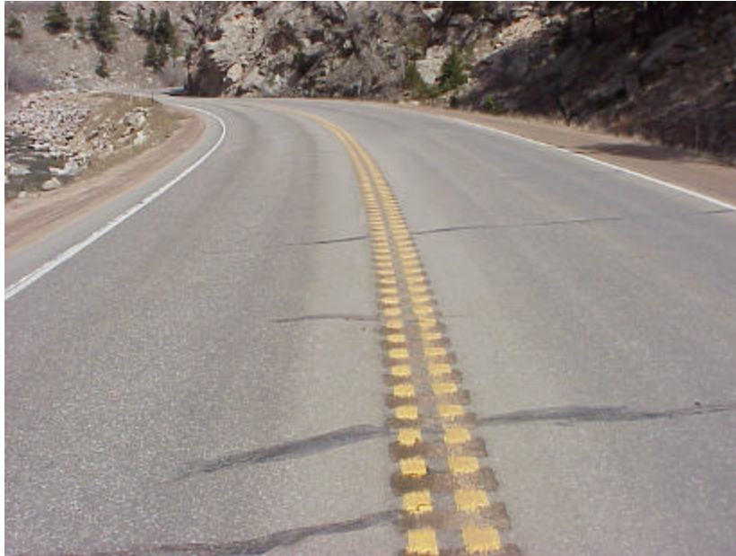
Figure 1. State Highway 119 in Boulder Canyon winds through Forest Service land.

The centerline rumble strip site is located in Boulder Canyon on SH 119 from Milepost (MP) 23, just east of Nederland, to MP 40, about two miles west of Boulder. This is a winding stretch of two-lane highway that has limited site distance and a double yellow "no passing" center stripe for most of its length (Figure 1). In the 17-mile stretch through the canyon, centerline rumble strips were placed at all no passing locations except through intersections. In areas where sufficient sight distance allowed safe passing, no rumble strip was installed.