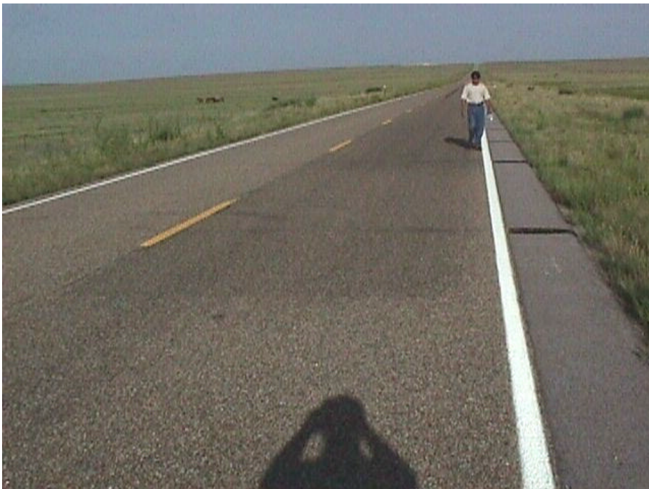
Figure 2. The fog seal section starts where the pavement is darker. The dark stripes on the shoulder are seals applied to transverse cracks before the chip seals were placed.