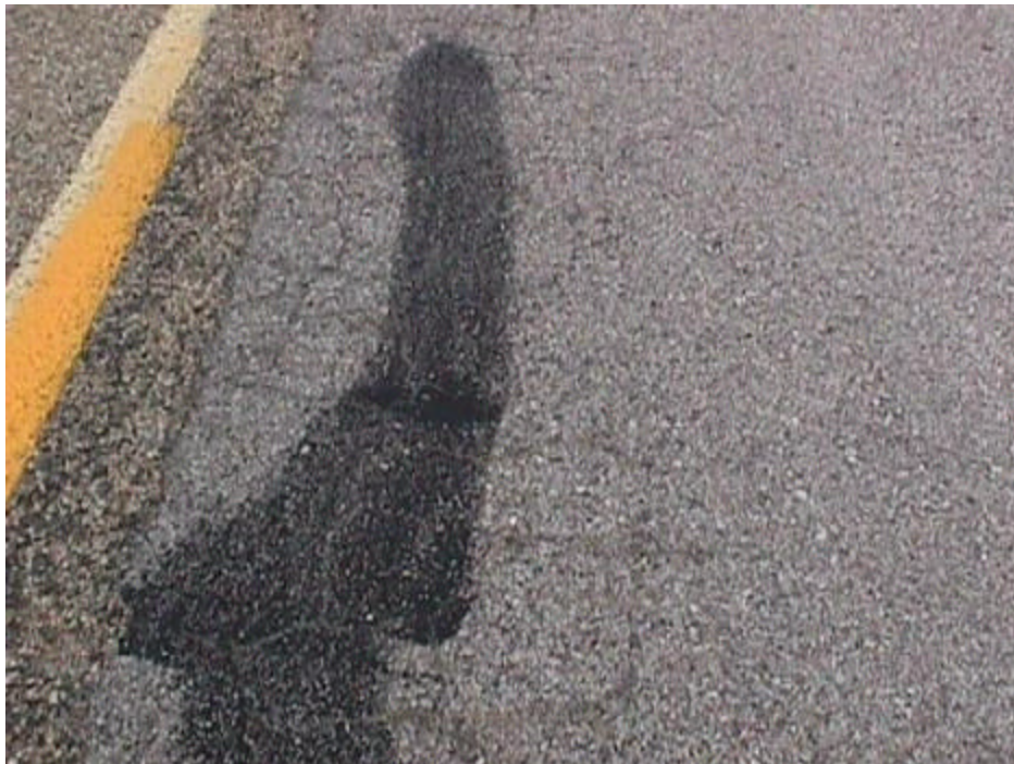
Figure 6. Block cracking is developing in the control section near the skip stripe.

These are loose chips piled on the old pavement surface with a dime to show their size.