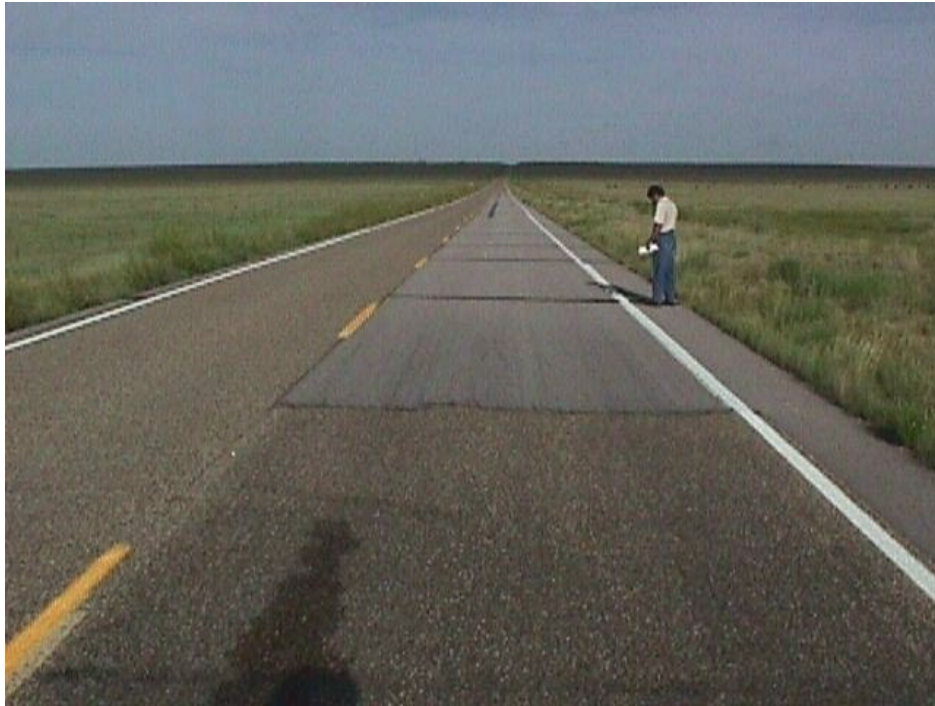
Figure 1. Looking west from the fog sealed section into the control. The dark stripe next to the figure is a sealed crack. The dark patches in the left wheel path are water where the skid tester had just finished testing.