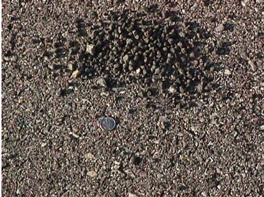
Figure 5. A handful of the light weight chips.

These are loose chips piled on the old pavement surface with a dime to show their size.