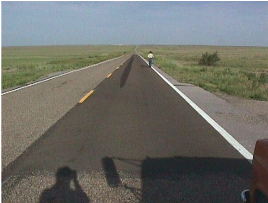
Figure 3. The light weight chip section at the east end of the site. The right lane is the light weight chip seal. The dark patch in the left wheel path is water left by the skid testing equipment.