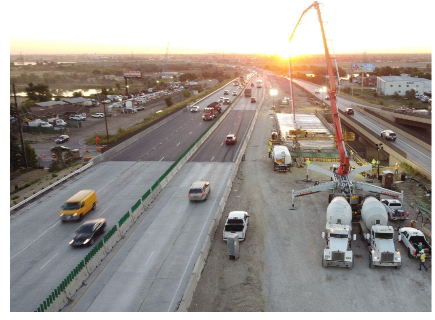
I-70 West Metro Bridges