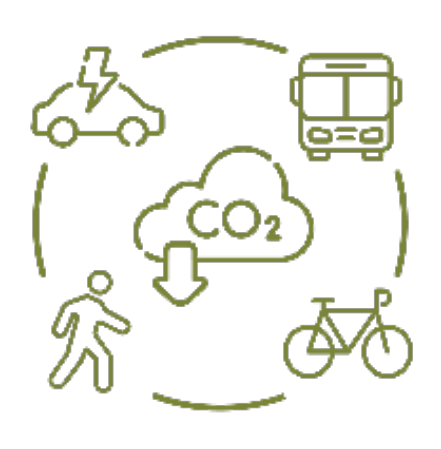
Sustainably Increase Transportation Choice