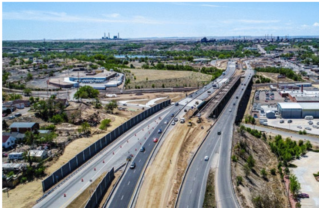
I-25 through Pueblo New Freeway Ilex Interchange