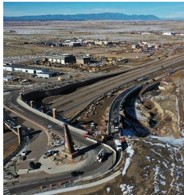
I-25 at Exit 104 - Dillon Drive Improvements