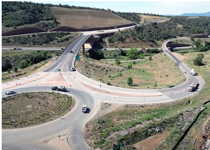
US 550/160 South Intersection