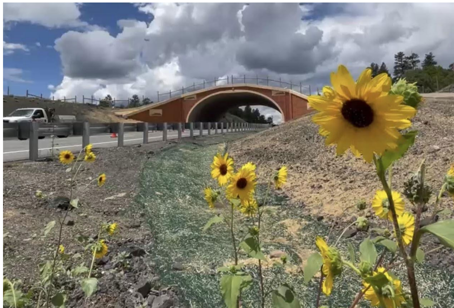
US 160/SH 151 Safety Enhancement Project