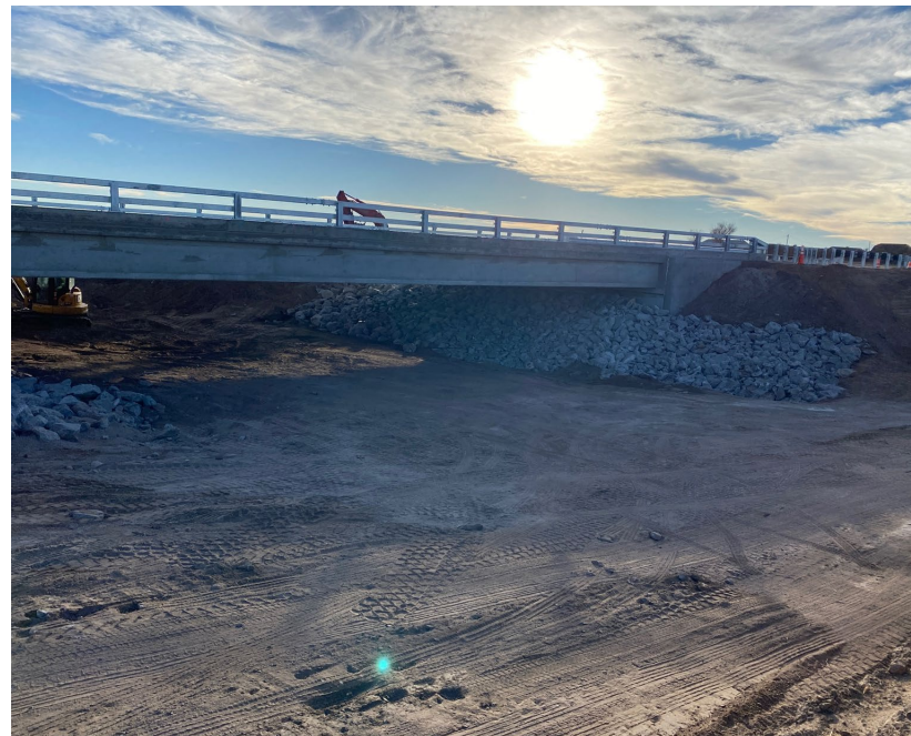
Bridge Replacement CO 61 north of Otis