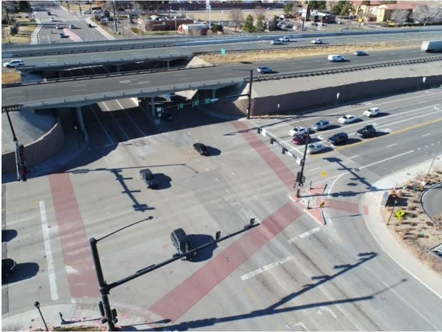
I-70 West Metro Bridges