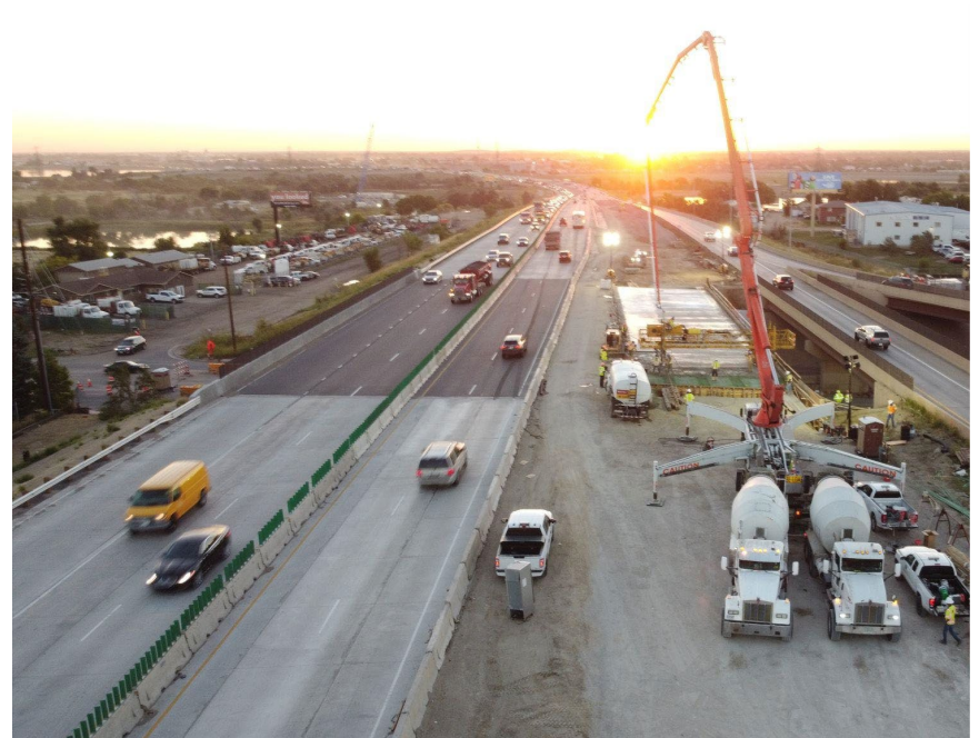
I-76 From York to Dahlia: Bridge Replacement and Concrete Pavement Reconstruction