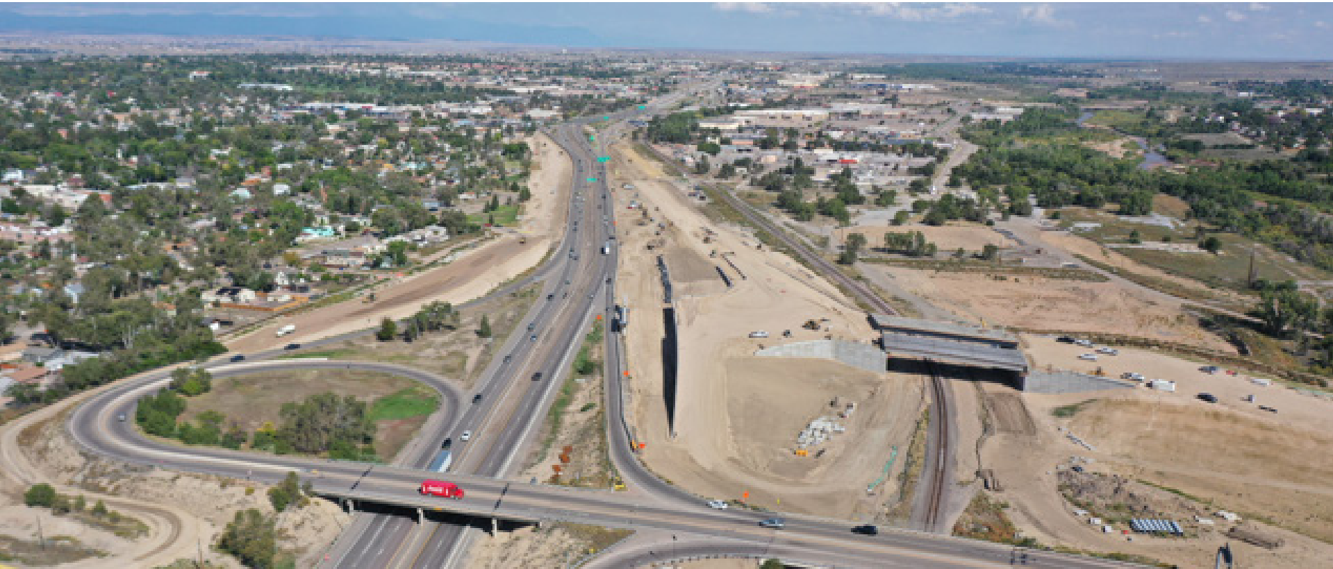
I-25 and US 50B Interchange Aerial View

The I-25/US 50B Interchange project is the second project of the New Pueblo Freeway. The project will deliver improved safety by addressing deteriorating bridges and non-standard road characteristics on I-25; and improve local and regional mobility within and through the City to meet existing and future travel demands. The delivery of the project will: construct the first diverging diamond interchange in Pueblo, increasing operational efficiency and improved safety; expand the city’s trail system with a connection to the east and west sides of I-25; remove an at grade rail crossing; and restore the east/west freight connection of US 50 in Pueblo.