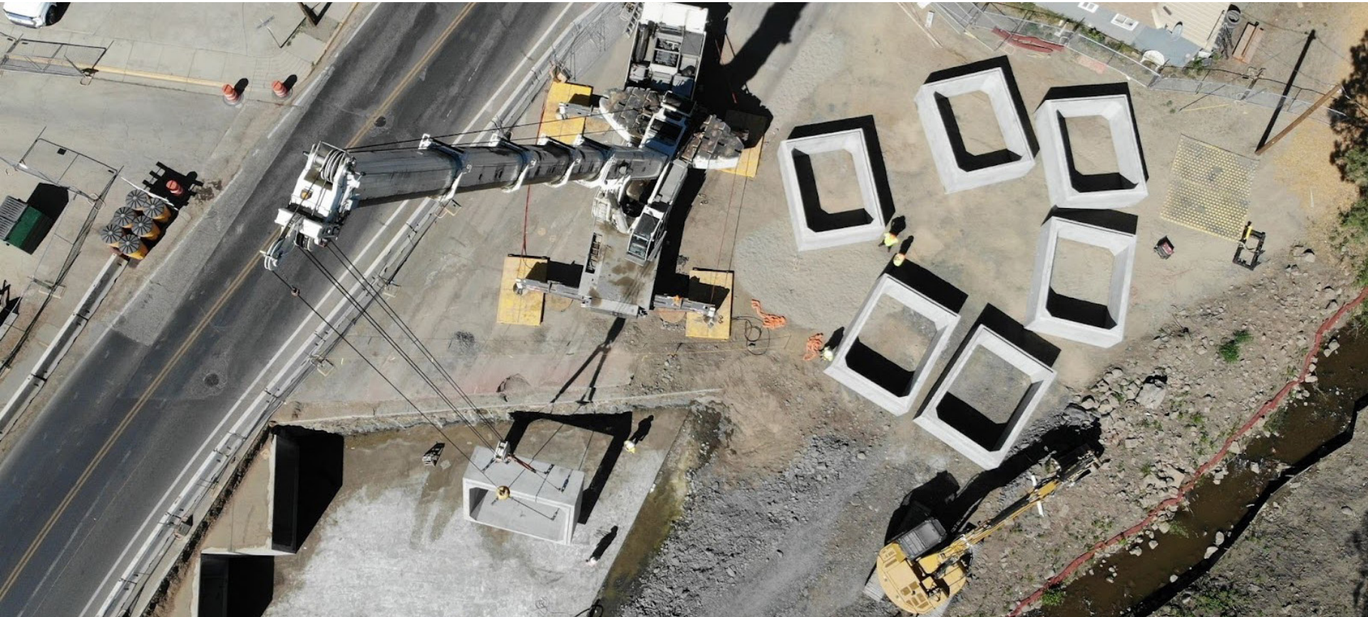
Aerial photo of a crane lifting pre-formed concrete box culverts into place at the McCabe Creek project site in Pagosa Springs

New precast concrete box culverts replaced outdated metal culverts on McCabe Creek, which flows under US 160 in downtown Pagosa Springs. McCabe Creek is a critical drainage watershed into the San Juan River. The new concrete culverts are more durable during severe rainfall events or spring run-off, minimizing the risk of flooding. Aside from improved hydraulic efficiency, the concrete structures also provide resistance to corrosion for an extended lifespan.