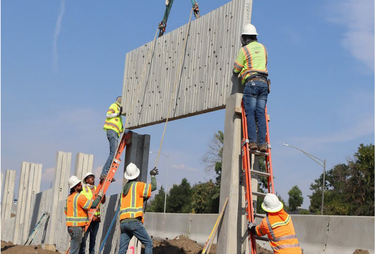
Six construction workers wearing safety vests and helmets are assembling the I-70 Noise Wall Replacement at I-76 to Pecos Street