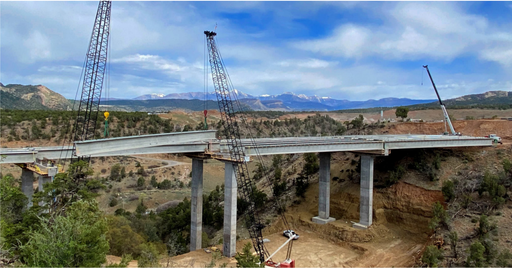
US 550-US 160 Gulch A Bridge.