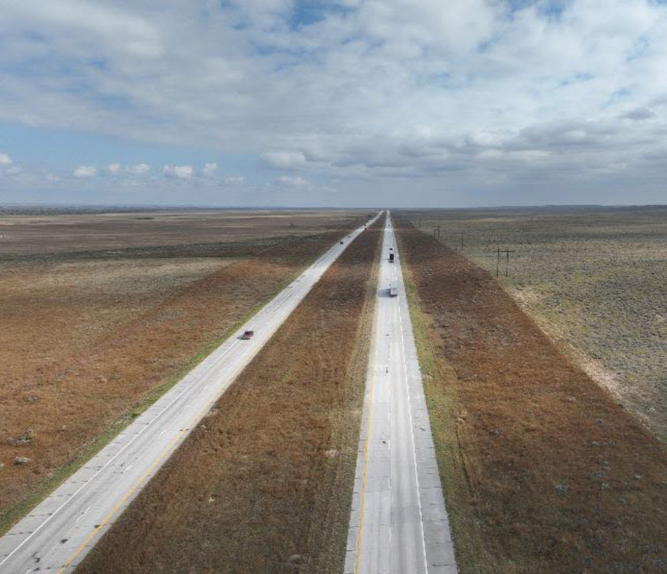
Aerial photo Before improvements of Interstate 76 between the Crook and Iliff Interchanges