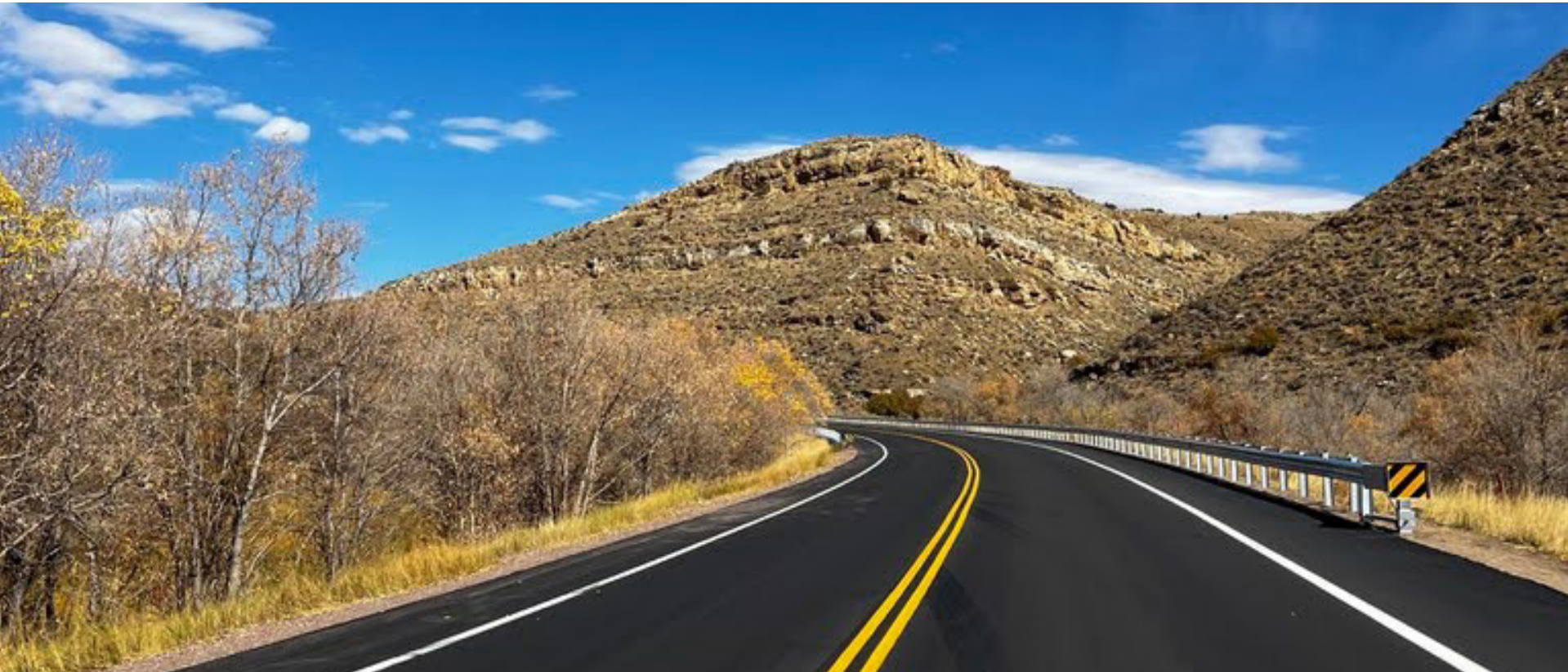
Completed surface treatment on CO state Highway 317 in northwest Colorado

A 12-mile stretch of CO Highway 317 east of Hamilton has received a fresh asphalt surface, new roadway striping and several sections of new guardrail.