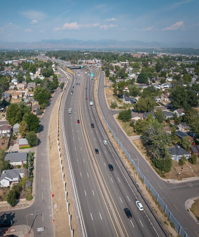
Aerial photo of the I-70 Noise Wall Replacement