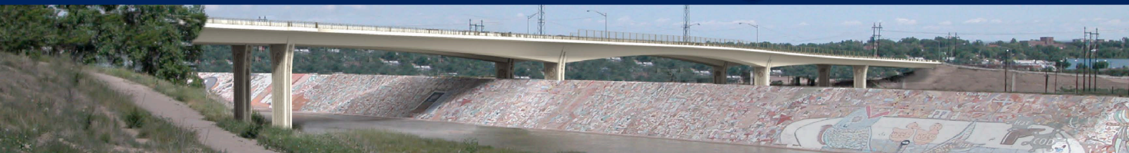
View From Bluff