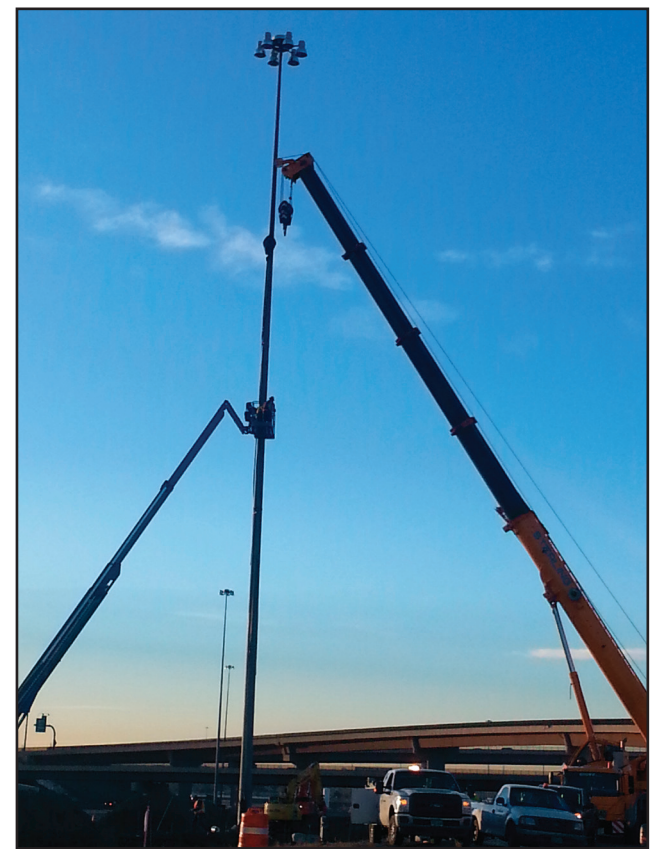
Crews install overhead lights.

Normal working hours are Monday through Friday from 7 a.m. to 4:30 p.m., and no lanes will be closed during the day. Night work, requiring double lane closures, will take place from 9:30 p.m. to 5:30 a.m. Some night work on Fridays as well as weekend work will take place as needed.