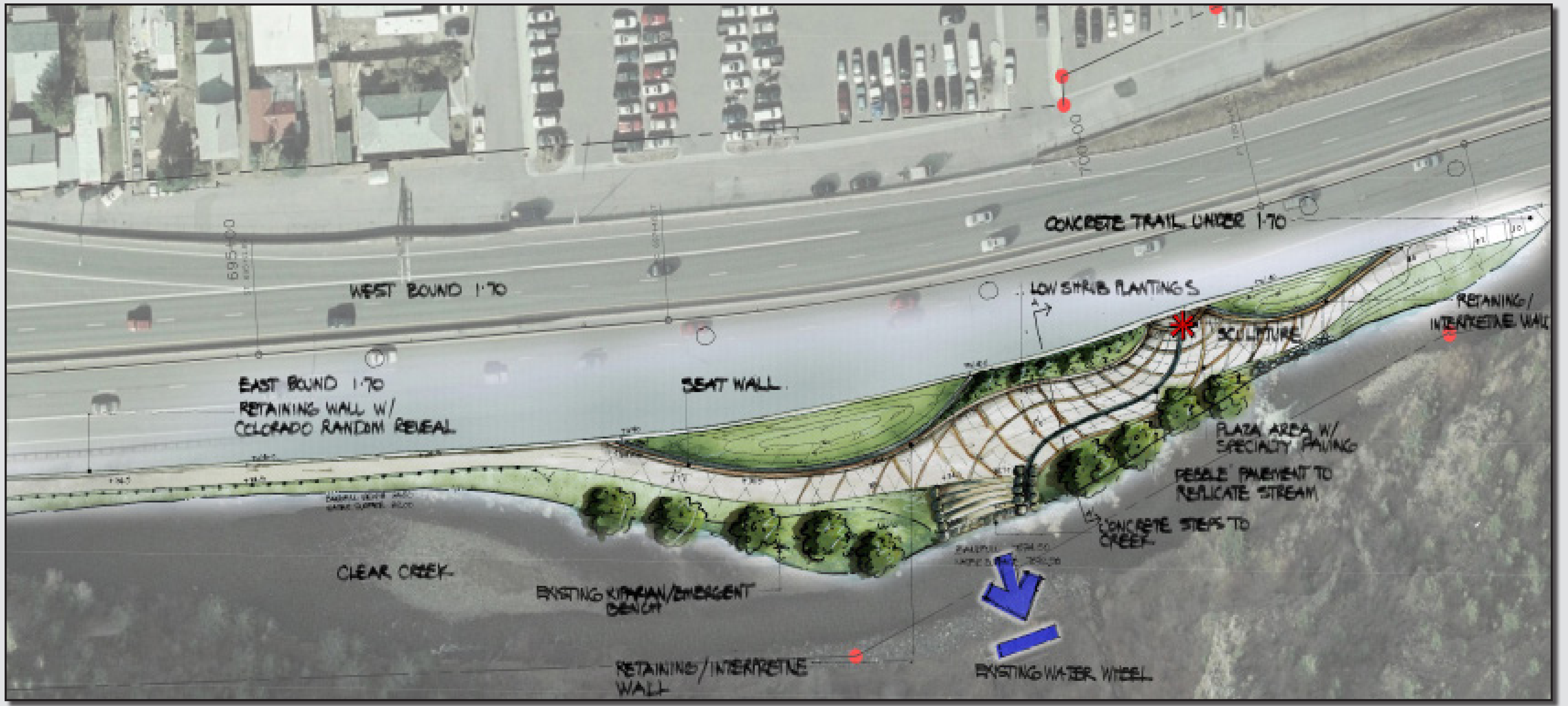
PLAN VIEW OF WATER WHEEL PARK

The project includes improvements to Water Wheel Park, including: