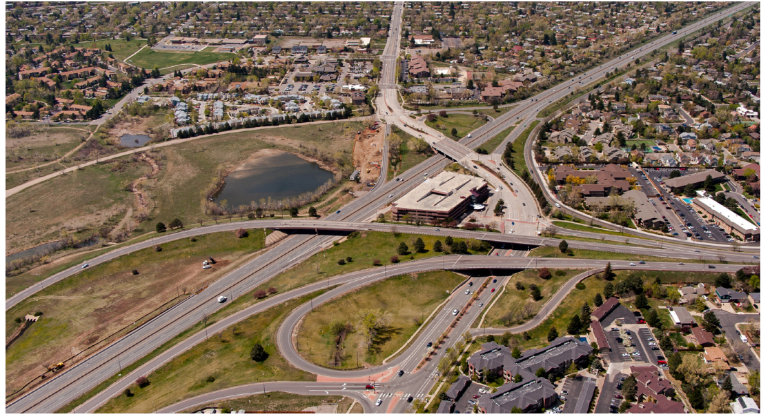
US 36 at Table Mesa Drive