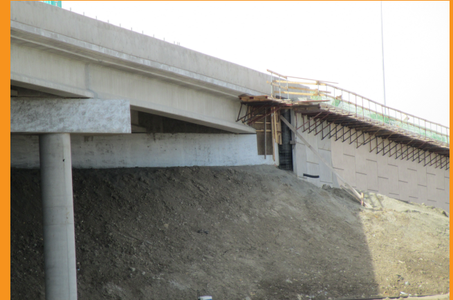
BNSF bridge and noise wall construction