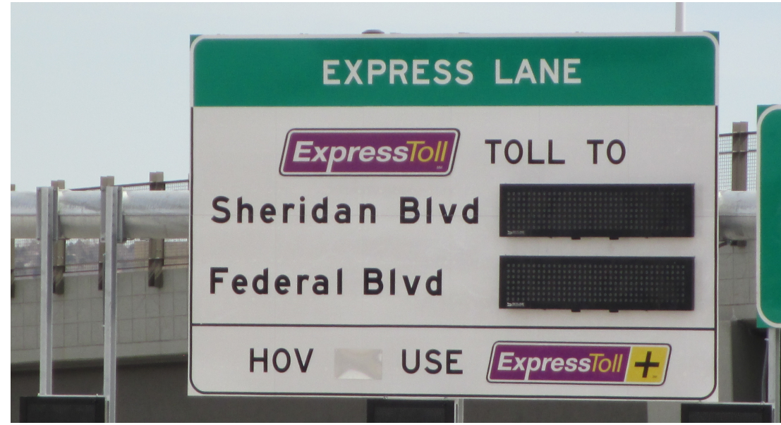
New ExpressToll signage