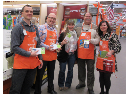
The EcoPass program launch at Home Depot

Organizations located within one-quarter mile of US 36•McCaslin, US 36•Broomfield and US 36•Sheridan Park-n-Rides were eligible for the EcoPasses. This initiative is part of a larger Transportation Demand Management (TDM) program in conjunction with the US 36 Express Lanes Project. At its peak, the TDM effort will reduce traffic congestion by close to 27,000 vehicle miles of travel per day.