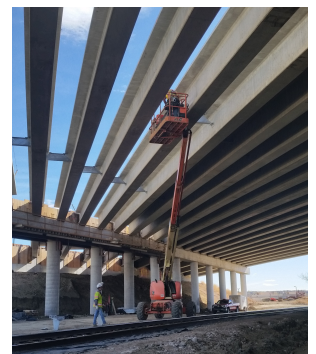
BNSF bridge work

US 36 Bridge over Promenade - Final aesthetics work will continue through March.