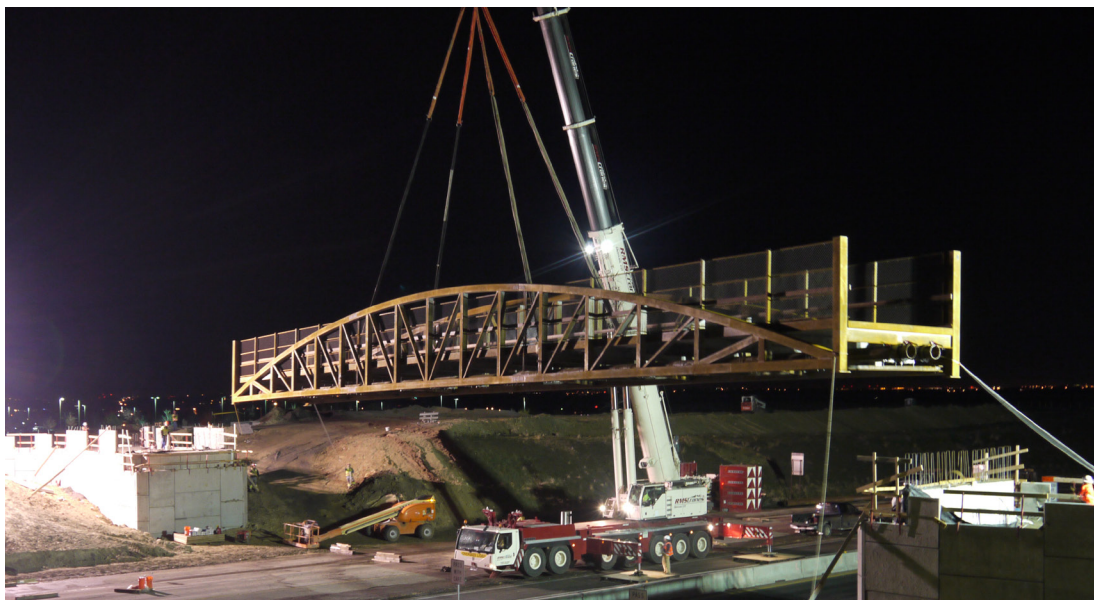
Placing the pre-assembled bridge across US 36