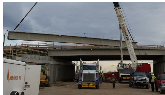
The final Sheridan bridge girders swing into place

The final 16 girders – each weighing approximately 88,000 pounds – were placed on the new Sheridan bridge in April, allowing the final phase of construction to begin. Now that the girders are in place, crews will begin work on the bridge deck and the connection to Sheridan Boulevard, with the final bridge opening this fall.