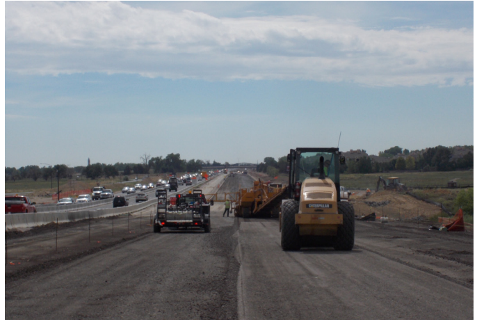
Roadway preparations for concrete placement