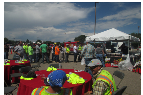
Ames Granite crew members at the celebration barbeque

The week concluded with a Safety Leaders celebration barbeque for all the crews and project team to celebrate a safe week and everyone’s hard work.