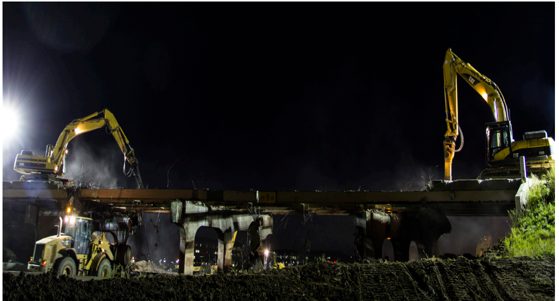
Heavy equipment working in tandem to demolish the Olde Wadsworth bridge.