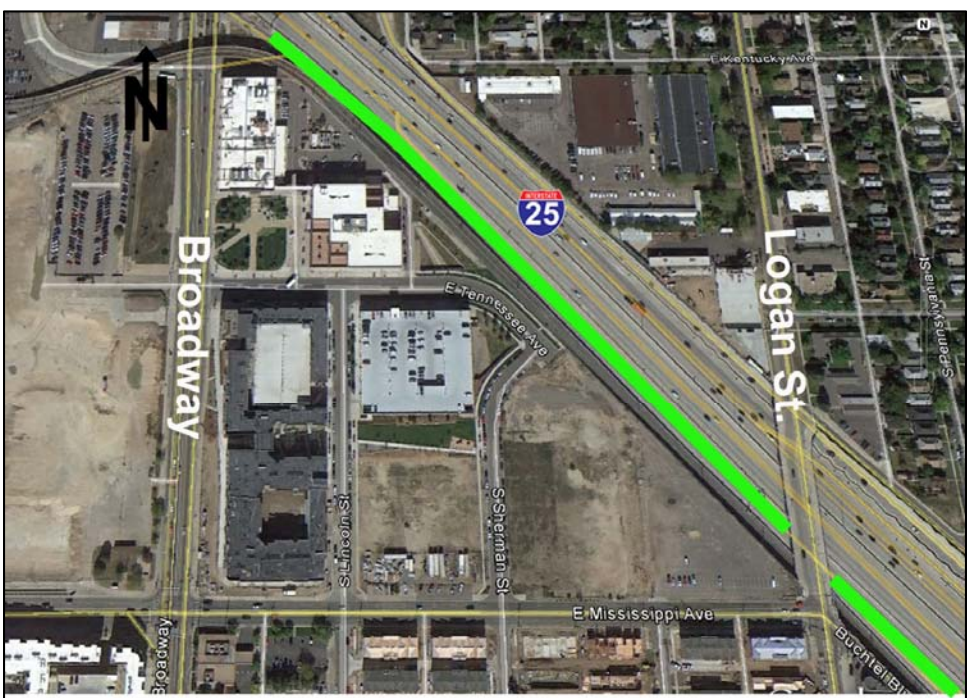
Southbound I-25 collector-distributor lanes between Broadway and Washington St.

It will be the end of October before the US 6 Bridges Design-Build Project is substantially complete and the C-D lanes are open, so anyone wanting to get an idea now of how these lanes operate can see a similar alignment along southbound I-25 between Broadway and Washington Street. This C-D lane provides access to local streets along with a longer acceleration distance for drivers entering southbound I-25 from Broadway.