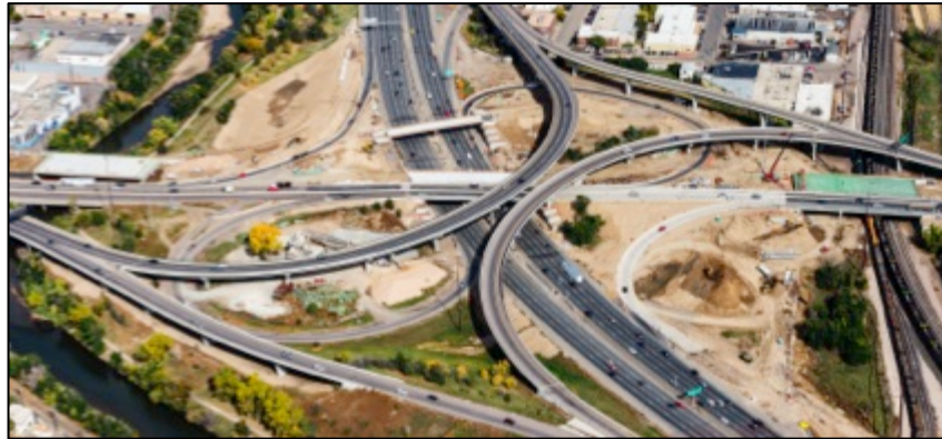
Aerial photo taken Oct. 15, 2014