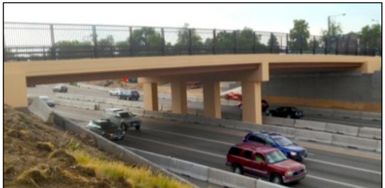
New Knox Court bridge