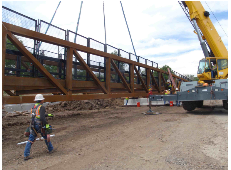
Pedestrian bridge was delivered Wednesday, May 27, and will be set in one 9-hour shift