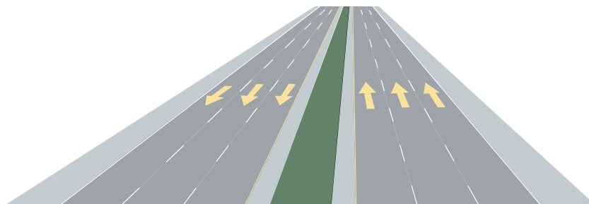
6 Lane Facility I-25 to Quebec