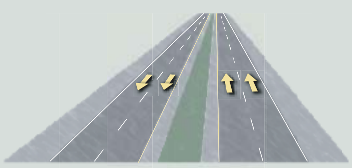
4 Lane Facility Kipling Parkway to Quebec