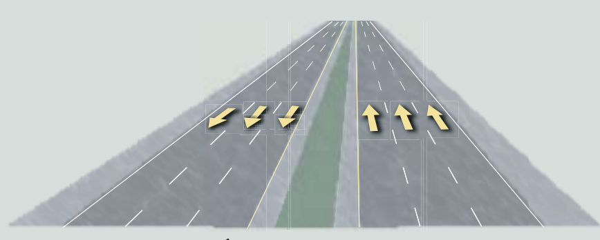
6 Lane Facility Quebec to 1-25