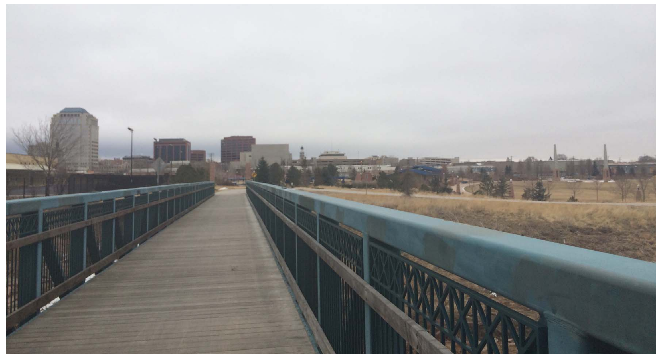
CONTINENTAL TRUSS PEDESTRIAN BRIDGE EXAMPLES