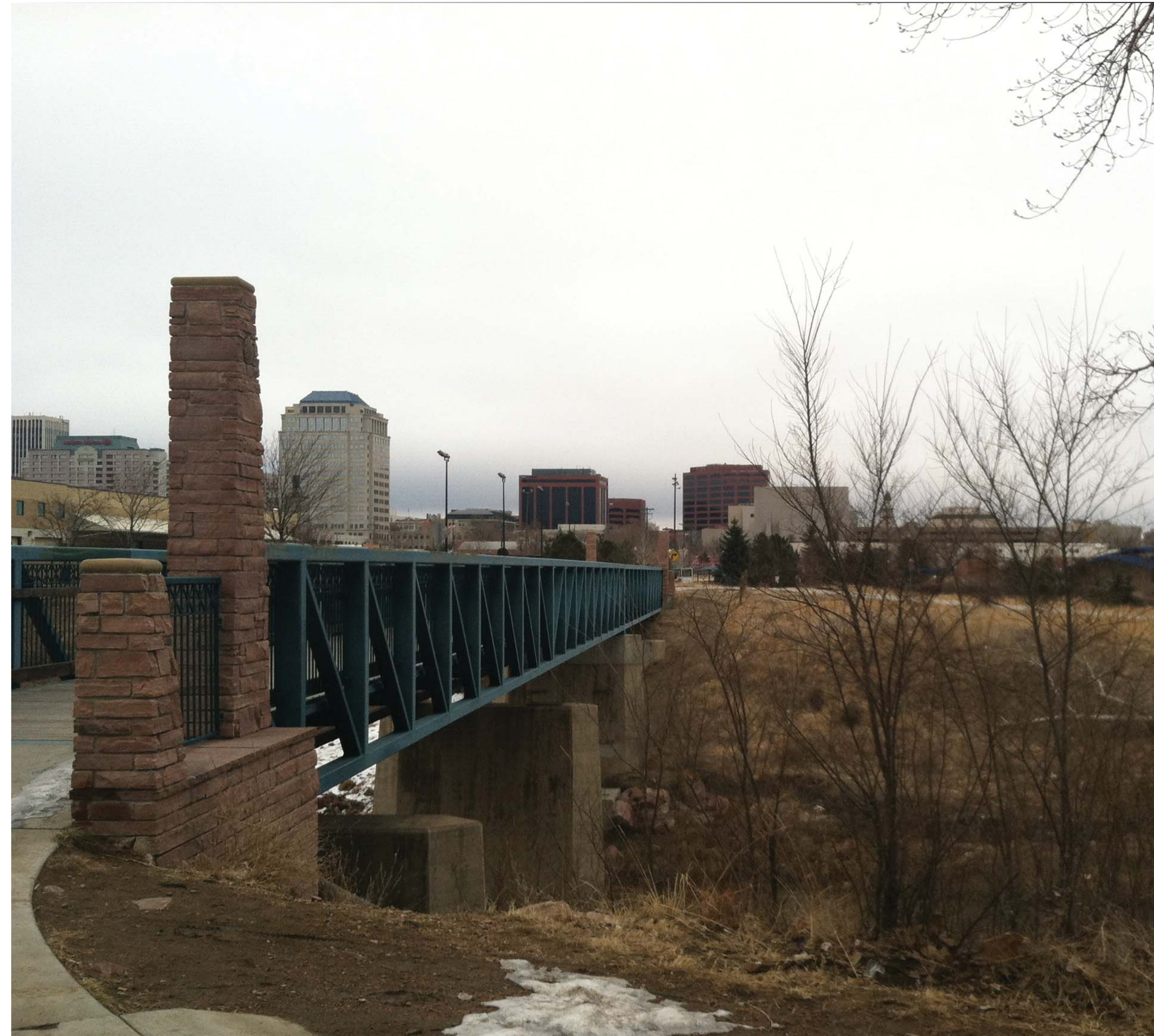
ENHANCED PEDESTRIAN BRIDGE AT ATB PARK