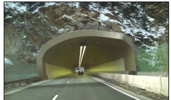
The rebar on the right side of this photo shows where a retaining wall will be poured in place to help keep rocks from rolling onto the westbound lanes of I-70.

Once this final work along I-70 is complete, crews will turn their attention to restoring County Road 314, making improvements to