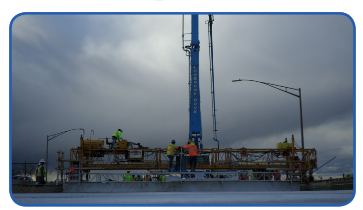
Paving northbound bridge at Indiana Avenue